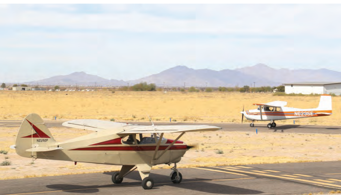
Two small engine planes with pilots, prepare for take off during a pilot licensed training at Ak-Chin Regional Airport which sits on the Ak-Chin Industrial Park lands.

A commercial airport landing in Ak-Chin may not happen anytime soon, but who knows, in decades that may be a possibility.