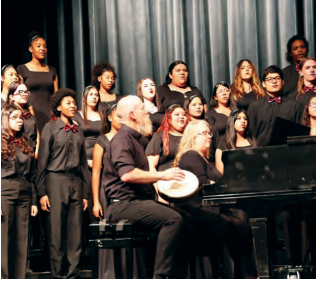
Spring Singing continued from Front

Table”. The group’s tone was effortlessly harmonious, making for a beautiful sound and the night was filled with a unique look into various genres from all over.