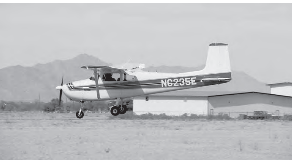
A small engine plane prepares to "touchdown" at Ak-Chin Regional Airport during flight and landing training courses.

Early in its identity as the Ak-Chin Regional Airport, other services it provided, was training for Public Safety in personnel in the Air Evac field.