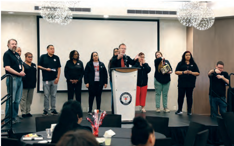
New and veteran staff of the education department make introductions to parents and guardians during the first parent night for the spring quarter, with special guest and fun raffles throughout the event.