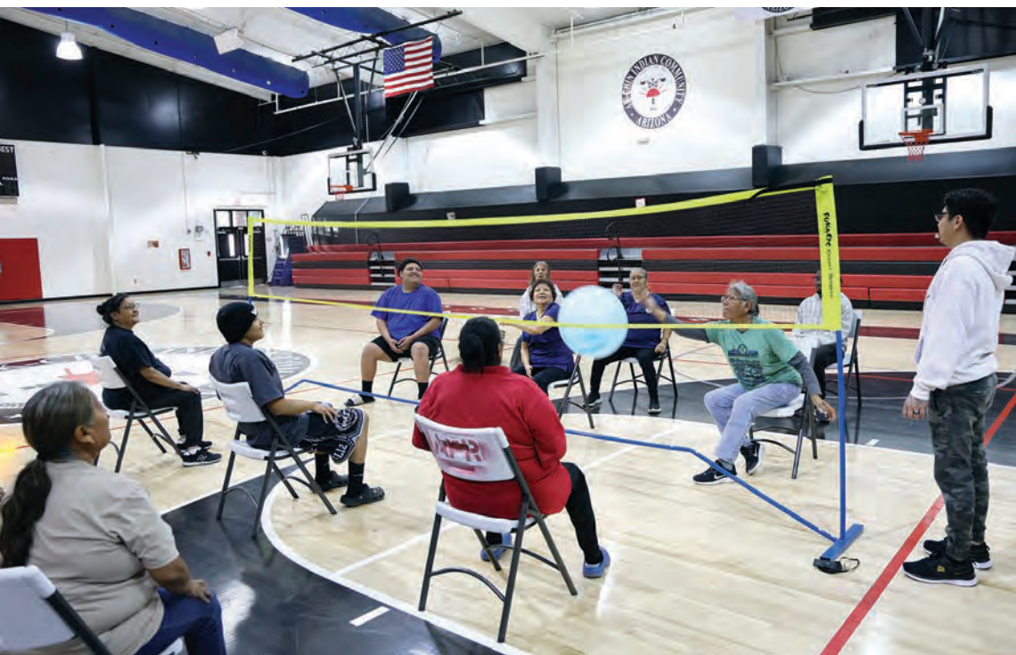
Chair Volleyball will be one of the main events at Ak-Chin Recreation's Inaugural Senior Games, March 25-26.