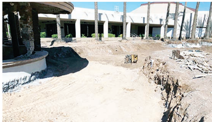
Construction photograph of the Harrah’s Ak-Chin pool renovation project.