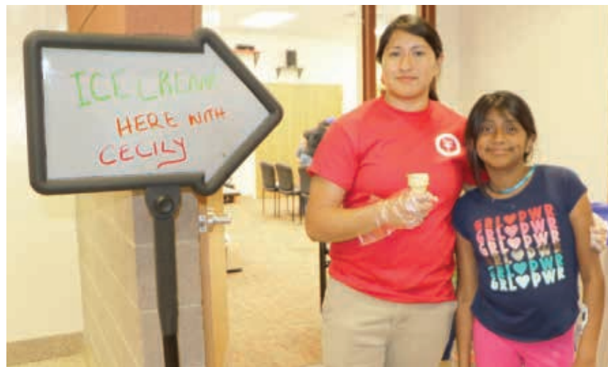
Everyone could go and have ice cream in the multipurpose room.

It's been ten years since the Ak-Chin Community Library and Education Center has opened its doors for the Community. Since that time the facility has become the Community's hotspot for consecutively inspiring and providing scholastic programing.