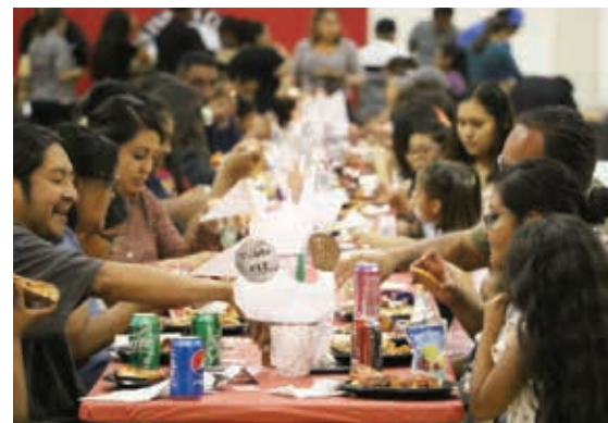
Families gather around the table to eat pizza together during the Mini Spring Sports Banquet.