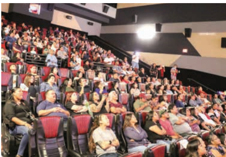
The theater gets jam packed as families come to watch the special ceremony.