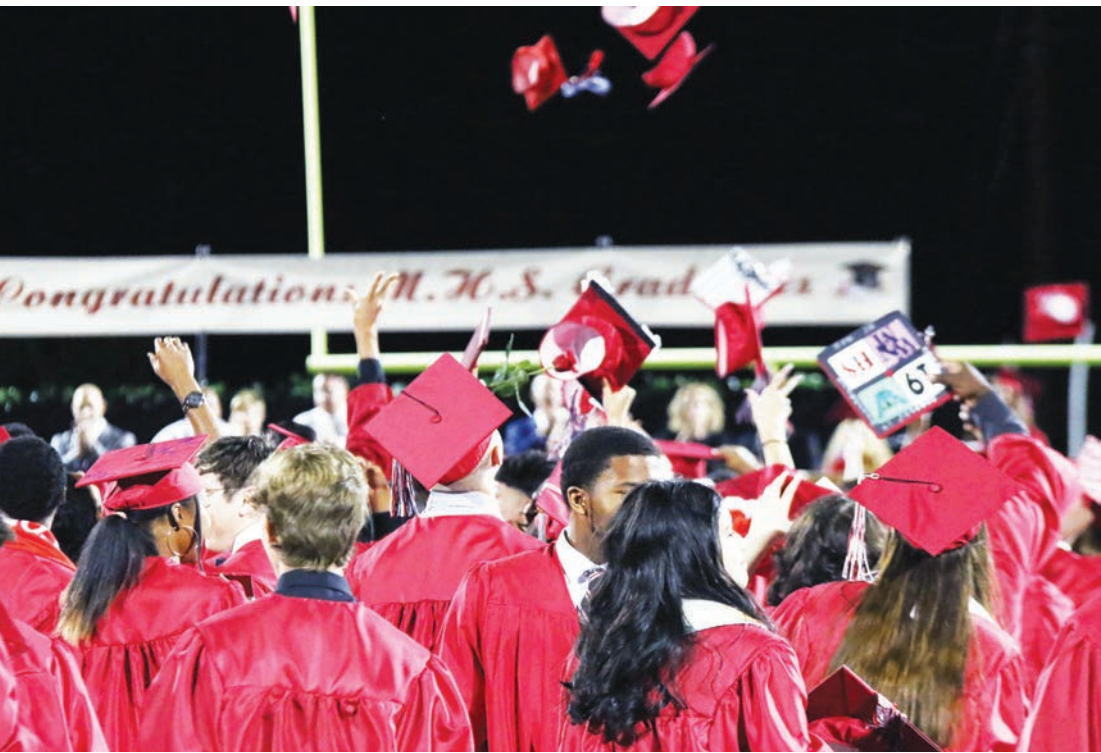
MHS students toss their caps in the air with glee as they embark on a new journey.

MHS has 19 Lumberjack Scholars through Northern Arizona University, 11 Obama Scholars through Arizona State University, one Fry Scholar, one Flinn