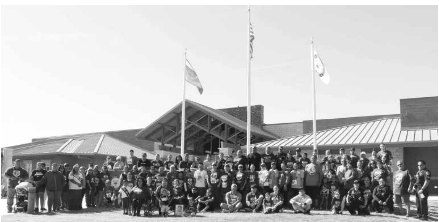
Over 100 participants registered for the Ak-Chin PD Memorial 5k. All received a free shirt and breakfast.