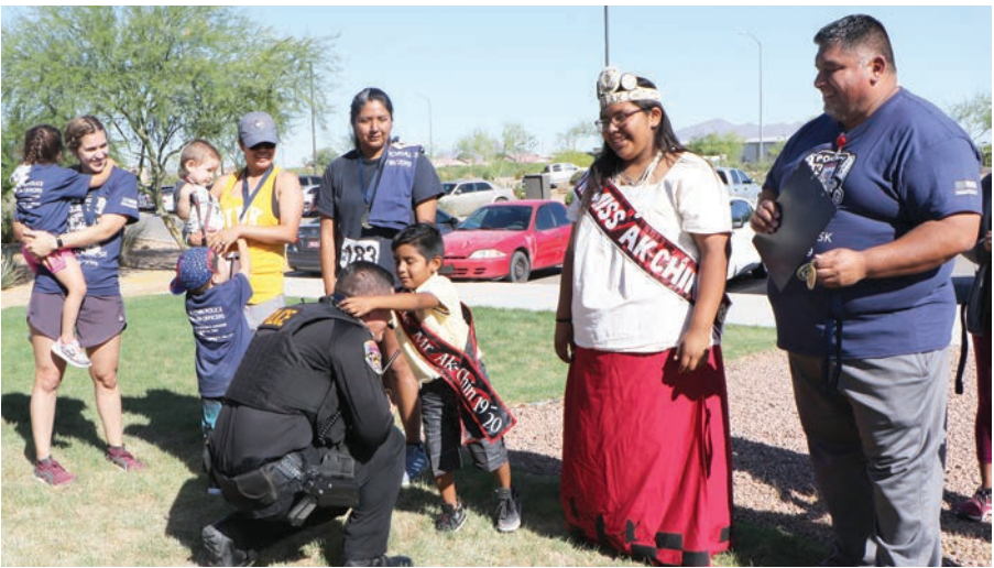
PD Memorial continues to page 8a