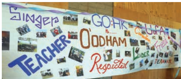
An Ak-Chin Youth Council designed banner.