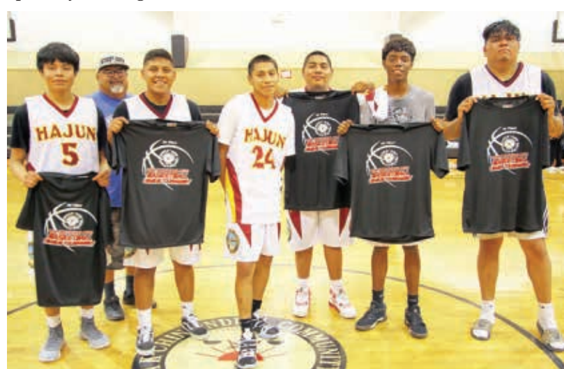
BOYS CHAMPS - Gila River