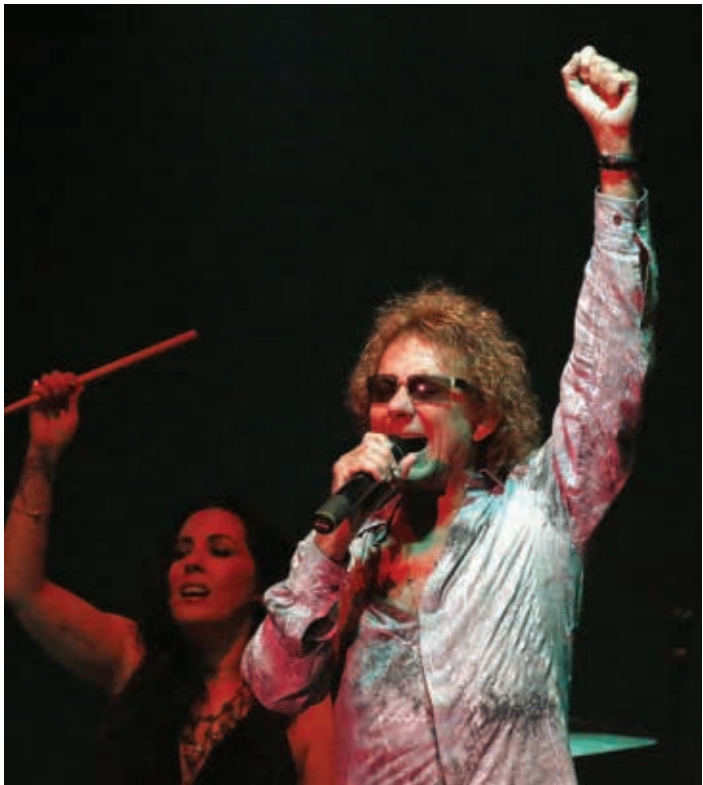
Mickey Thomas belts out a song during the opening set of Starship at the Harrah's Events Center.

Opening act Starship hit the stage, starting their set with Lay It On The Line. With a catalog of hits that started with Jefferson Airplane,