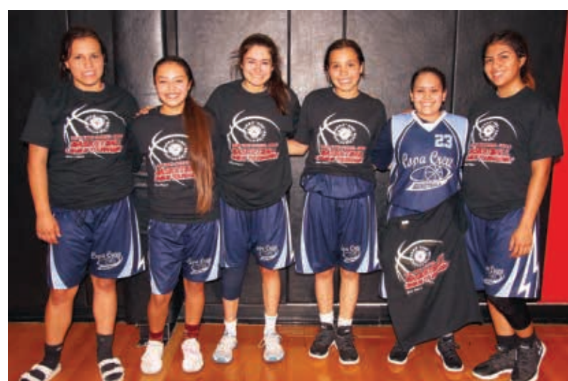
2ND PLACE - Copa Crew HYPE