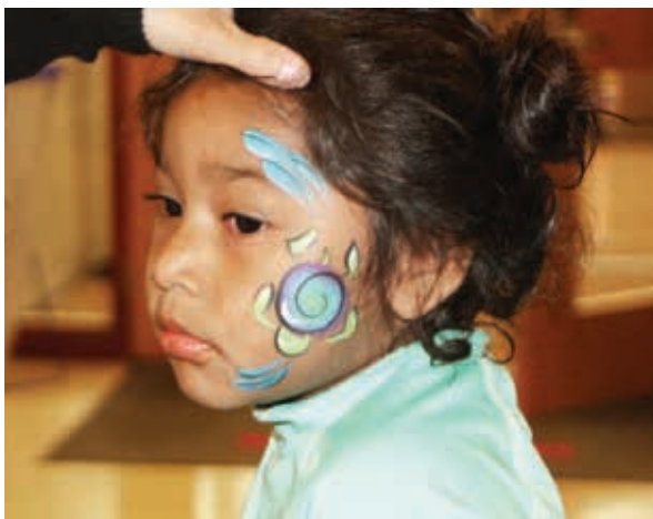
An example of the colorful cute face paintings given at the anniversary celebration.