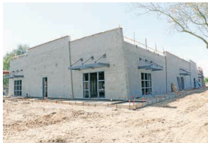
The Ak-Chin Child Development preschool expansion structure is still being added to as construction crews and contractors work to make the project a success for the benefit of young community members.