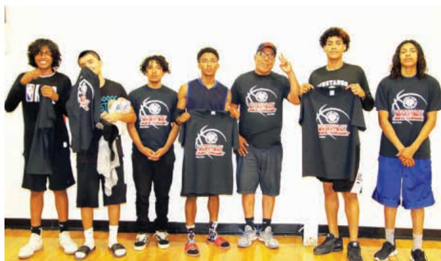
2ND PLACE - Snaketown