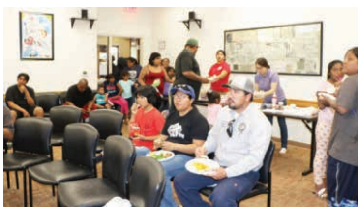
Attendees watch memorial video of the library past while enjoying some tasty dinner and tasty sweets.