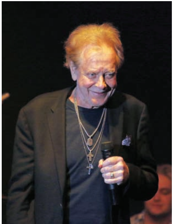
Rock legend Eddie Money greets the crowd at the beginning of his show. It was cut short.