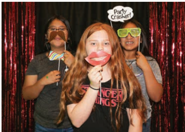
These girls pose for a funny photo.