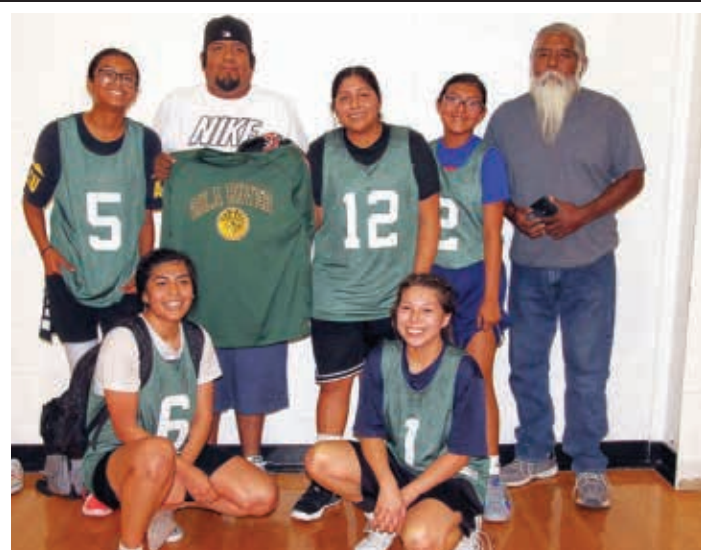
GIRLS CHAMPS - Gila River

T-shirts were given to the winning teams.