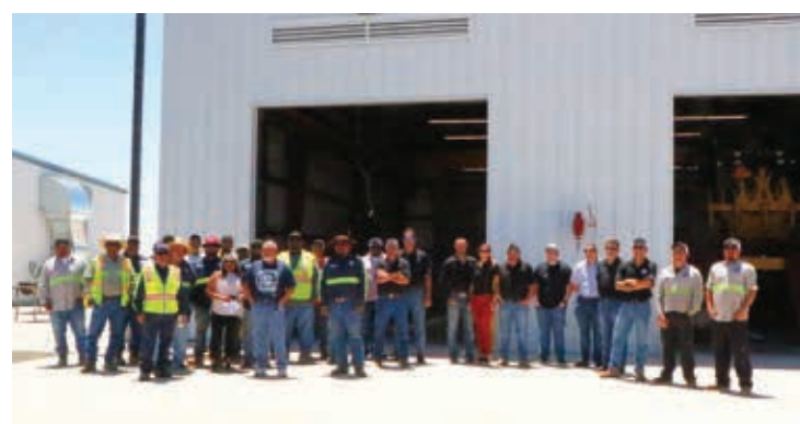
Ak-Chin Sanitation department during the Open House.

Lunch was served afterwards followed by viewing of the facility.