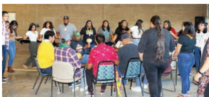
Member from all four O'dham-Pee Posh Youth Councils sing and dance in the Youth Council Bay.