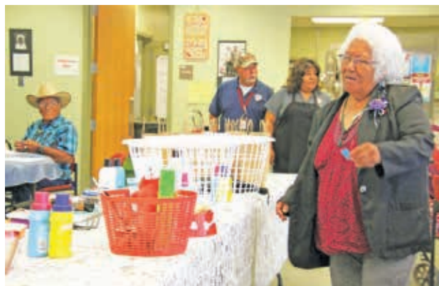
A visiting Sells elder redeems her winning raffle ticket for a basket of goodies.

The Ak-Chin congregate elders hosted a group from the Tohono O’odham Nation, Sells district on Monday, May 13. Arriving before lunch, the group