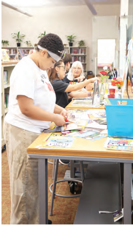
Above: There was plenty of magazines to pick from during the After Dark craft.