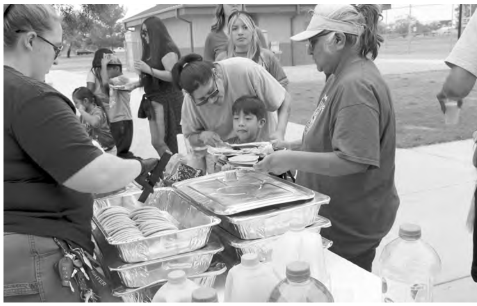
Guests take the opportunity to get a free breakfast plate that featured pancakes and sausage as well as drinks of orange juice, coffee and water.