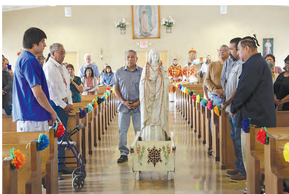
St. Kateri is celebrated during mass services at St. Francis Church in Ak-Chin.

The recipients who were nominated for their dedication and service received plaques, that were inscribed, "In recognition of your