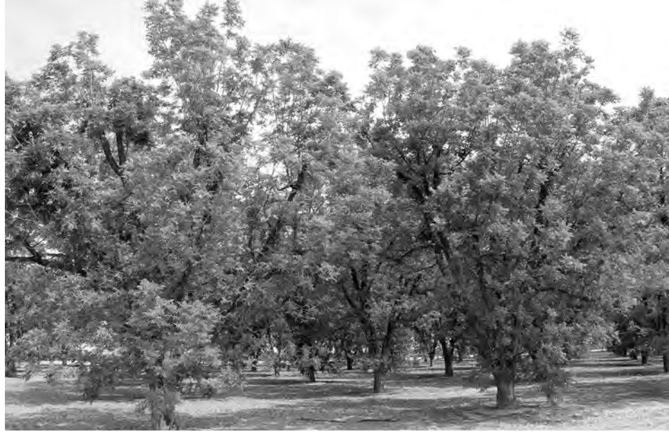
Early April, this was the site of the pecan trees located next to the Housing and Sanitation Departments prior to it being cut down for good.

has also displaced the many birds chirping and other species who called the pecan trees "home". When you drive to the end of the Community now, all you see is two remaining trees and scattered trunks of cut down trees.