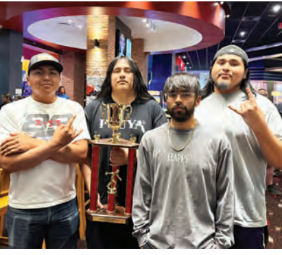
Team AKC represented well, earning second place honors.

Pin Pals bowled enough strikes to take home third place.