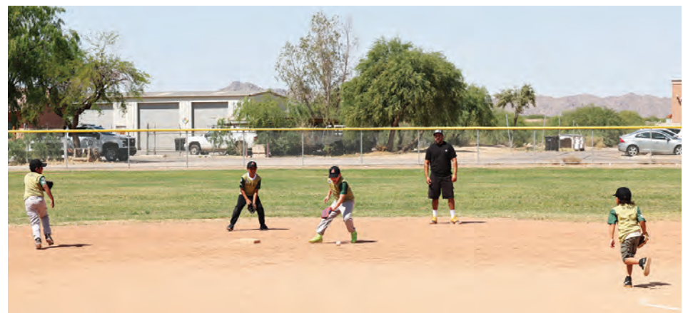
Below: Action Shot from infield.