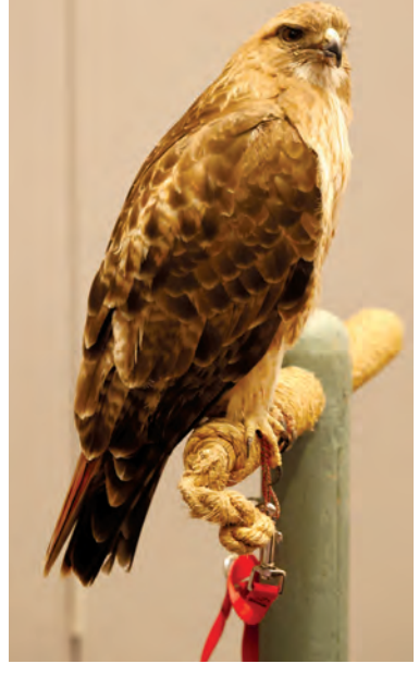
A beautiful hawk from Liberty At Heart was on display along with other bird species.