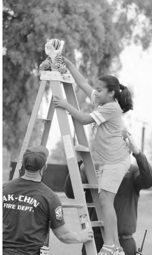
Rescuing a kitty was one of the tasks on the Fire Challenge course.

Congratulations to the Ak-Chin Fire department on forty years of keeping the community safe and providing the best emergency medical care possible for its members and for others!