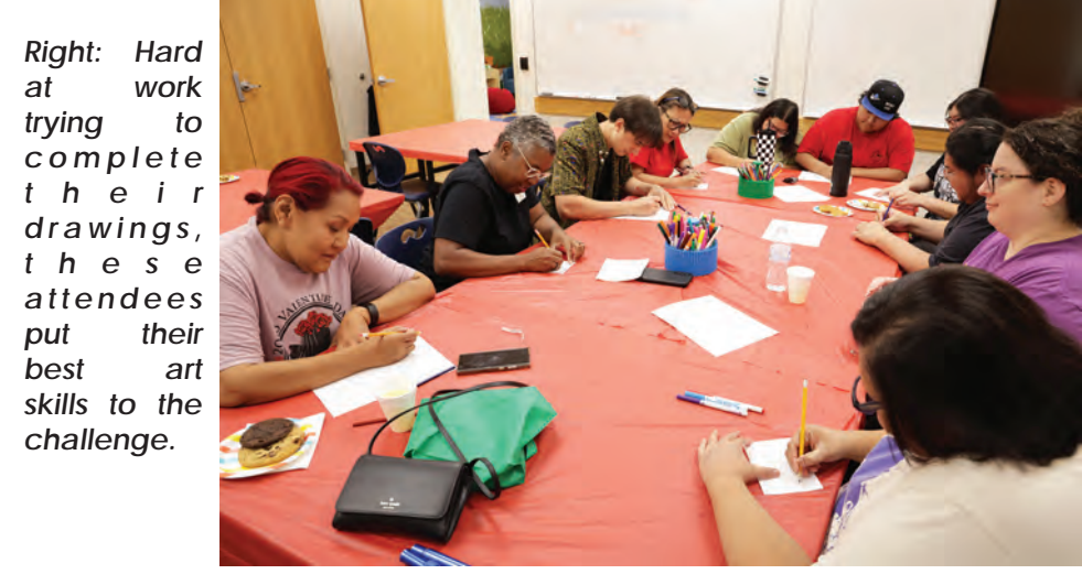
Right: Hard at work trying to complete their drawings, these attendees put their best art skills to the challenge.