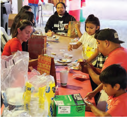
Decorating cookies was a "hit" for "Christmas In The Village" attendees.