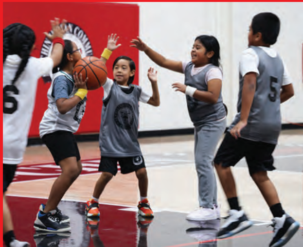
The first set of games began with the 3-5 age group taking to the court first.

If you wish to support them, they have games on Saturdays December 6 and December 20, 2025, January 10 and January 17 of 2026; starting at 10 am. For more information on the games or practices, please contact Parks and Recreation staff at 520-568-1740.