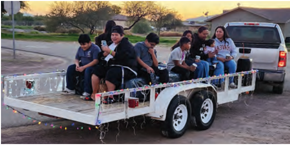
Taking a "hay ride" through parts of the community was a great time.

Please be ready for more Community activities and events planned for the next couple of weeks to celebrate the holidays and Ak-Chin's Masik Tas.