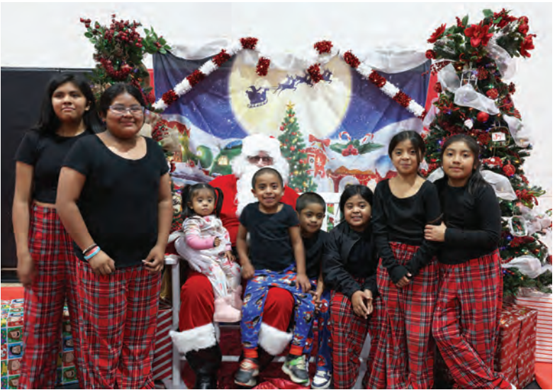
The Community Christmas was well attended as families enjoyed dinner, raffles, gifts, photos and visiting with Santa.