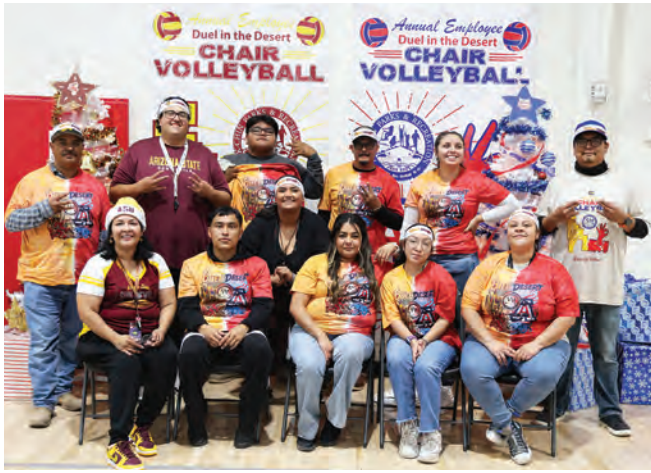
3rd PLACE - Parks & Reckless