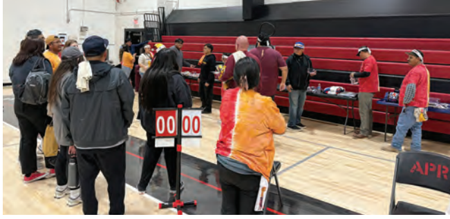
Raffle winners claim their prizes. And one lucky staffer from HR was even a two-time winner!

Congrats to Wildcat Country who battled it out in ASU territory, amongst all the Forks Up tailgates, as UofA claimed the rights to the 2025 Territorial Cup, with a 23-7 win against the Sun Devils on November 28th.