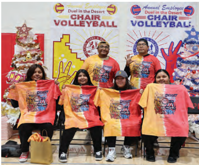
2nd PLACE - Suncats & Wild Devils

In the title game, Funner Runner jumped out to a quick lead and never looked back, making it back-to-back, as they took last year's title.