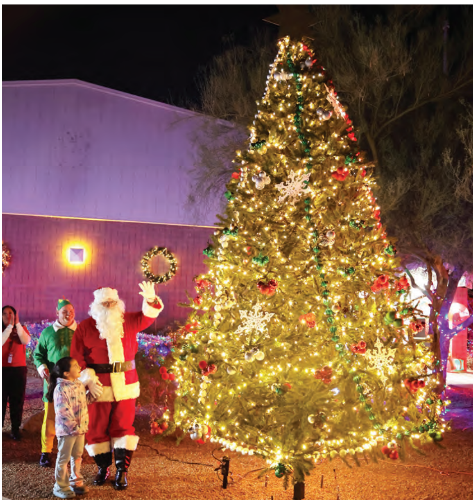
Santa Claus makes a special appearance in Ak-Chin Community to spread some joy and “Light Up The Village” for Christmas.