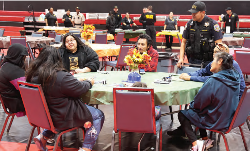
Community Members gather to enjoy a Thanksgiving meal prepared and served by staff from the Ak-Chin Police Department.