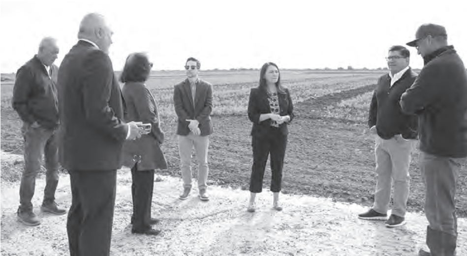
Ak-Chin Tribal Council and staff show Health & Human Services and IHS staff the designated site of the planned Health Facility.

Congratulations to the Ak-Chin Indian Community!