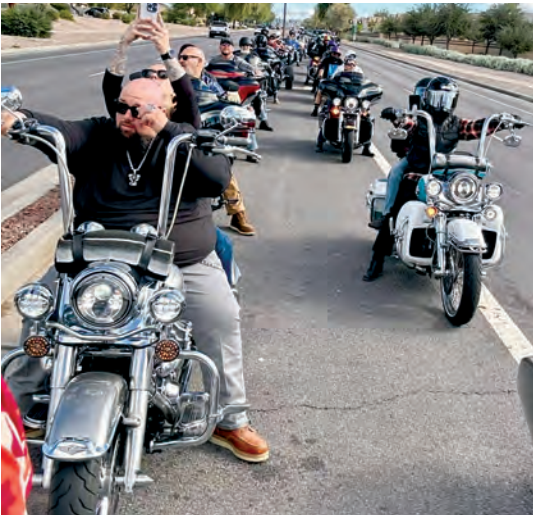
Bikers take to the road during Gobble Gallop.

Organizers said the fundraiser collected more than $1,200 and 300 pounds of food, including side dishes and canned items for the Pantry's community-wide