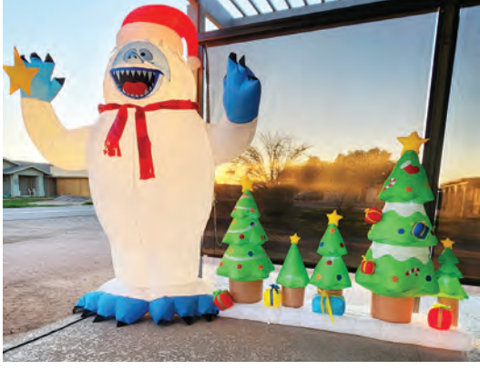
The Great "Snow Beast", makes an appearance at "Christmas In The Village".