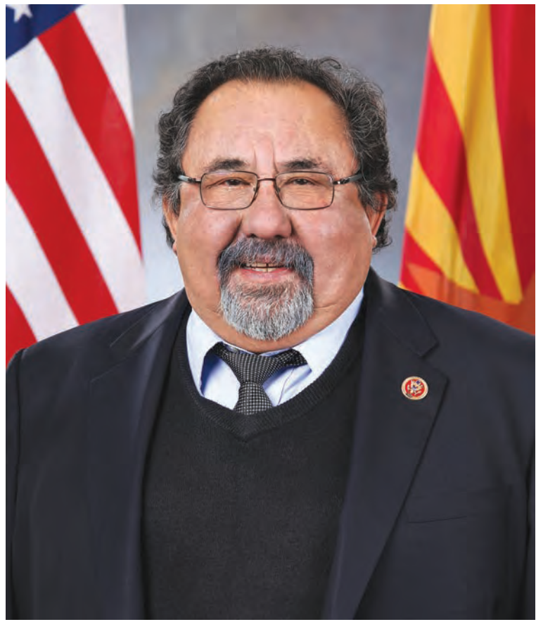
Congressman, Raul Grijalva (77), passed on March 13, 2025. He served as a member of the United States House of Representatives from Arizona between 2003 and 2025. Services are planned for next week in Tucson, Arizona.