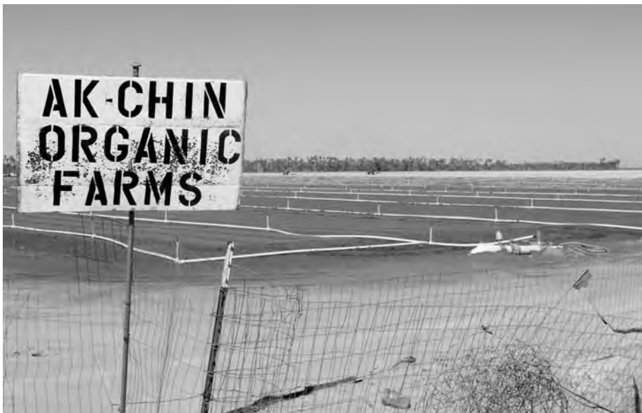
Ak-Chin's Organic Farms has been producing organic crops for consumers for five years. The Farm is located just west of the reservoir.