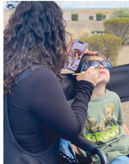
A young child sits back and enjoys his face painting.