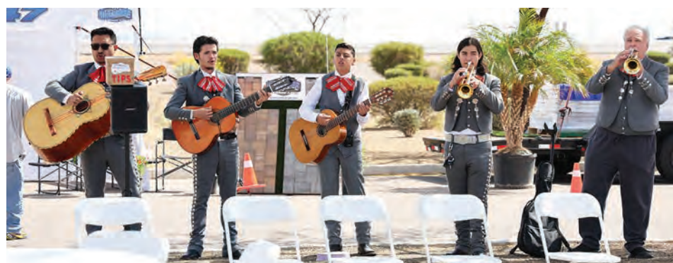
Mariachi Nueva Era “wows” the crowd during a set at the Food Truck Battle.