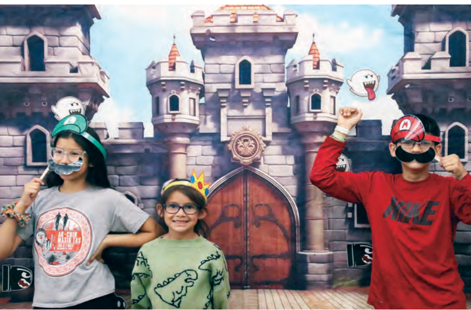
Mario Day attendees strike their best poses with Mario gear in front of Bowser's Castle.