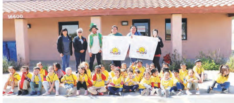
Preschool Students take photo with Runner Staff outside the Runner office.

At the end, Runner staff surprised the group with gift bags with snacks and goodies and a photo.