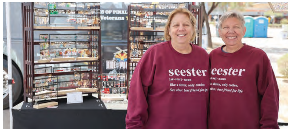
The Seesters had plenty of great arts & crafts for sale for attendees