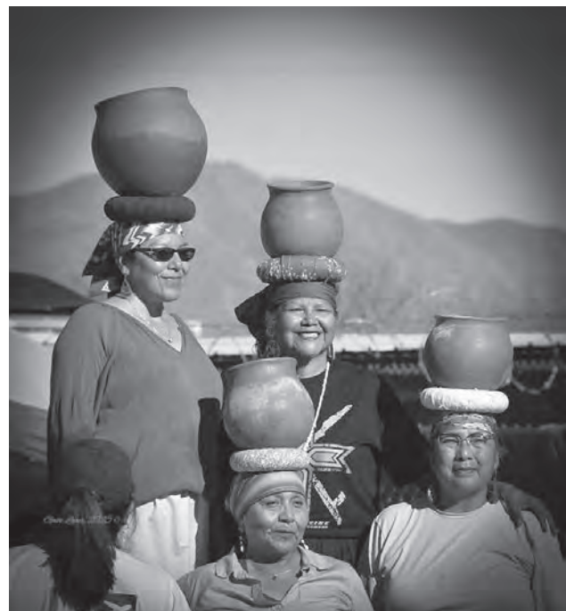
is an O'odham traditional game, the Ha'a Race, where elders balance the ha'a (claypot) on their head and race to finish.