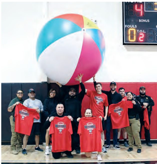
AKC PD takes second place in 2025 Mega Volleyball tournament.

Material submitted after the FEBRUARY 14TH DEADLINE cannot be guaranteed placement. If appropriate and relevant, it will be included in the next issue.