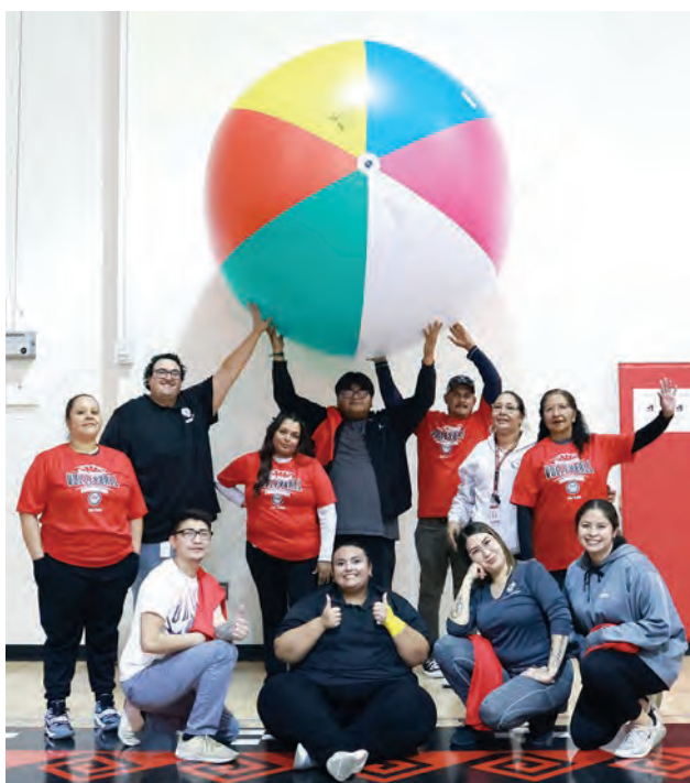
Parks and Reckless earn third place honors.