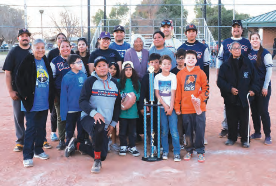
FIRST PLACE: WARRIORS