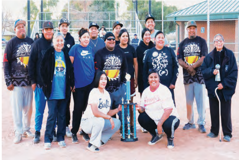
SECOND PLACE: II TRIBEZ