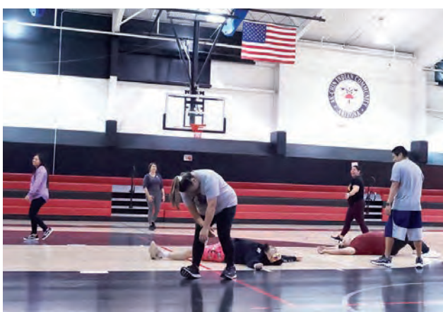
You can just see the agony of defeat in these players as they are totally devastated after losing out of the tourney.