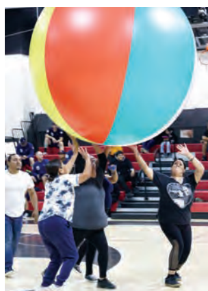
Teams from l-r: Preschool, Community Government and Human Resources; use strategy and strength to get the Mega volleyball over the net.