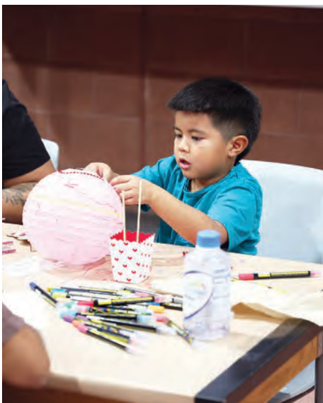
Pictured are community youth indulging in the many crafts and displayed are completed Valentine projects.

anyone. The Him Dak Museum has many arts related, holiday themed programs available for members and residents; be on the look out for the upcoming notices in the Runner!