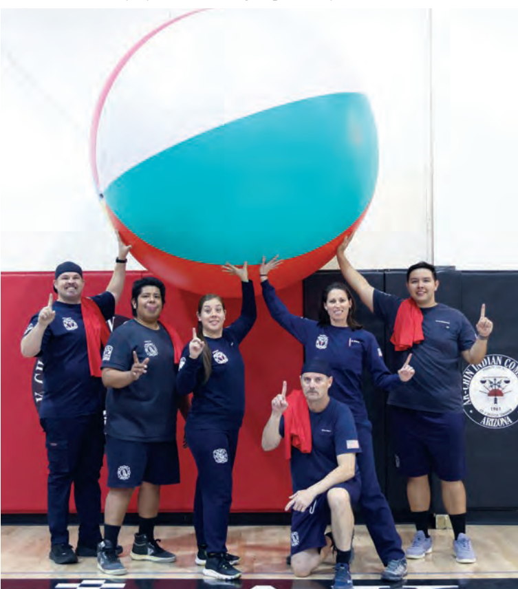
First place winner Ak-Chin Fire Department proudly throw up #1 after the face off with Ak-Chin Police Department.