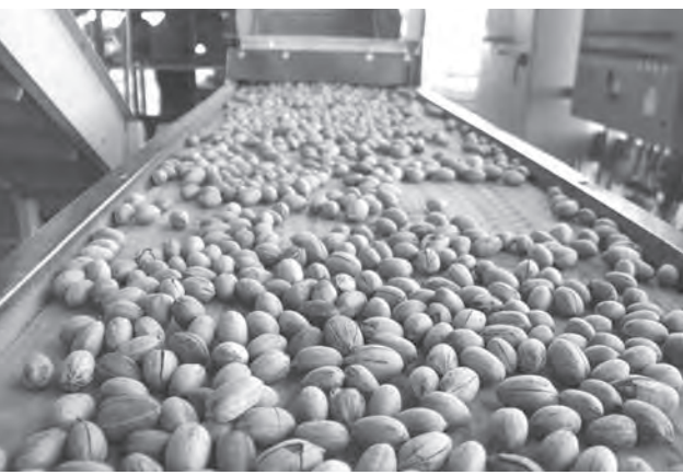
Pecans make their way through the conveyor for cleaning at the Ak-Chin Processing Plant.

"The Farms is always looking for new crops to bring income potential to the Farms and Community."