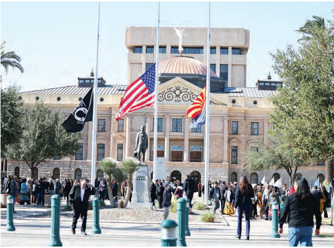
Attendees participating in the 30th Annual Indian Nations & Tribal Leaders Legislative Day, invade the State Capitol for leadership issues and sessions.