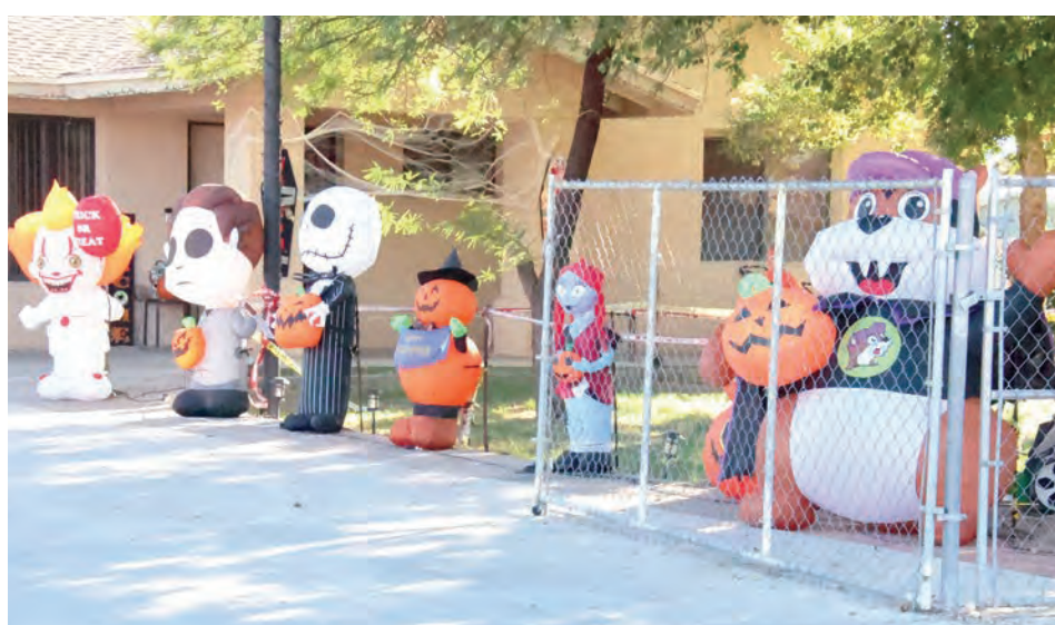
Congratulations to the Justin House for winning 1st Place for the Cutest Theme. More information and photos on page 5.