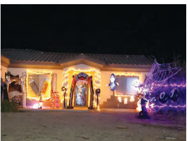
Best Overall Theme-2nd Place-Stephens Home