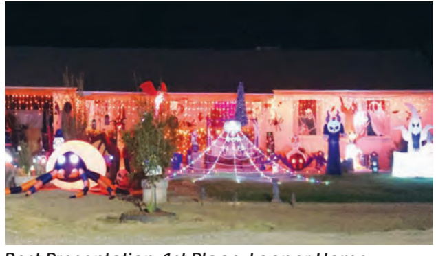
Best Presentation-1st Place-Looper Home

You may be the lucky winner of a special prize, all you have to do is open up the paper. 😊