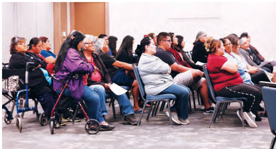
Meet the Candidate Nights fared very well, as over 70 Community Members were in attendance for both of the Meet the Candidate Nights.

The 2024 Council Election for Chairman, Vice-Chairman, and Special Election for one council seat will be held on Saturday, November 16, 2024, at the Ak-Chin Recreation Center, from 6 AM to 2 PM. Please remember to bring your tribal identification and good luck to all the candidates!