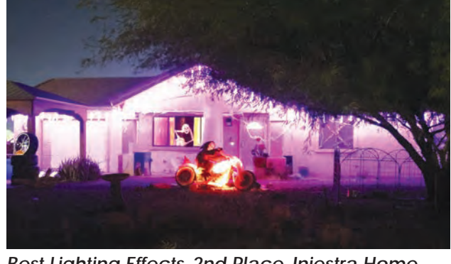
Best Lighting Effects-2nd Place-Iniestra Home