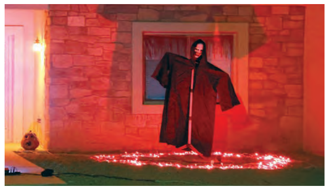
Scariest Home-2nd Place-Santiago Home