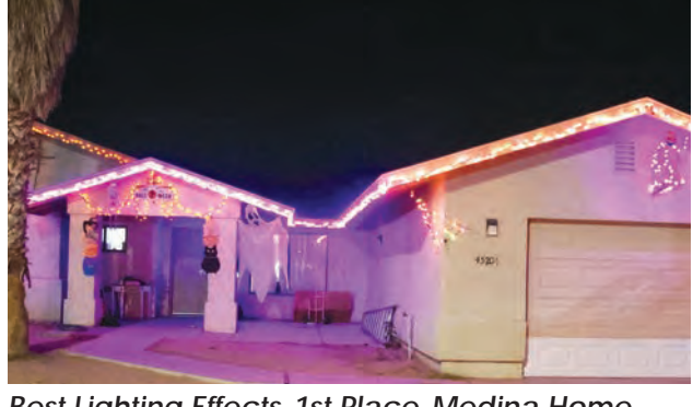
Best Lighting Effects-1st Place-Medina Home