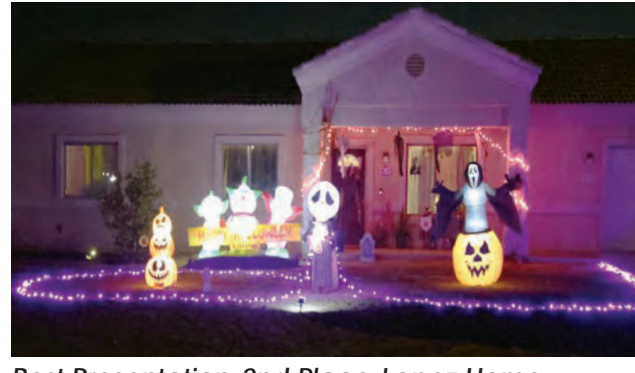
Best Presentation-2nd Place-Lopez Home