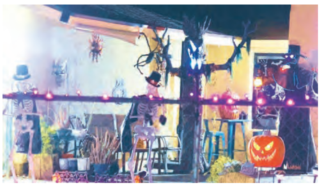
Scariest Home-1st Place-Pablo-Bandin Home