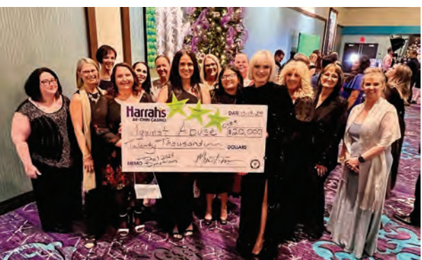
Harrah's Ak-Chin Casino volunteered more than 130 hours and raised more than $20,000 for Against Abuse in 2024.

Harrah's Ak-Chin Casino celebrated their volunteer and donation contributions during the Against Abuse Seeds of Change annual gala held on Oct. 19. Partnering with Against Abuse, a Pinal County-based organization that supports individuals affected by family dysfunction and domestic violence, Harrah's Ak-Chin Casino's HERO initiative enables casino team members to engage in meaningful volunteer work and financial support initiatives.