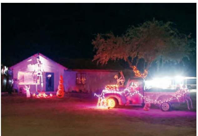
Best Overall Theme-1st Place-White Home