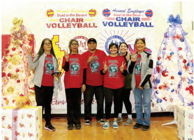
Team Him Dak captured 2nd Place.

Parks and Recreation will be hosting a Masik Task Elder Chair Volleyball Tournament December 6th, and we are looking for volunteers to help with line judging and score keeping. If anyone is interested, please email Recreation or call 520-568-1740.