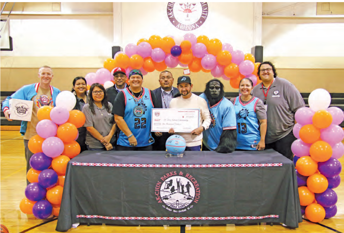
Above, members of The Phoenix Suns Charity Board, along with Ak-Chin Tribal Council and Recreation staff, stand together for check presentation, November 17.