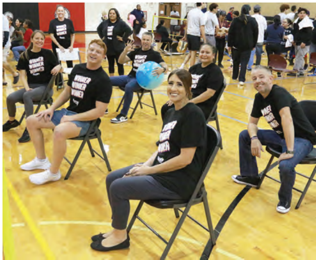
Harrah's Ak-Chin Winners took home 3rd Place.