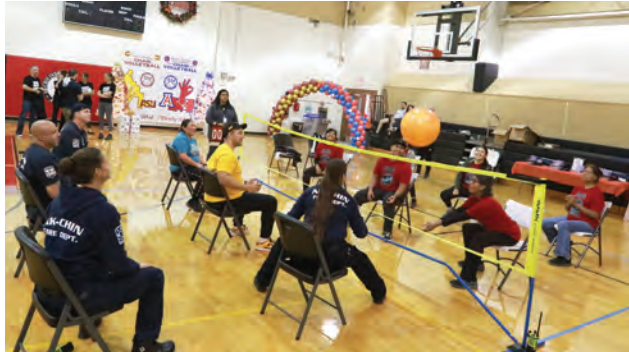
Action from the Winner-Take-All Championship Game between Fire and Him Dak.