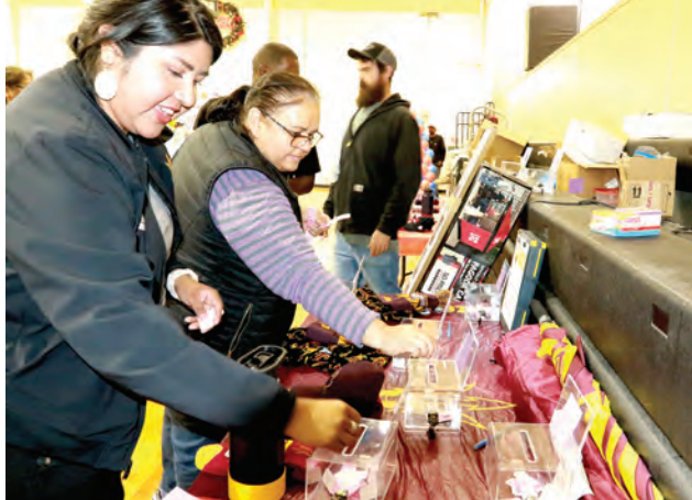
Employees wishfully place their raffle tickets in the boxes of their favorite team's prizes.