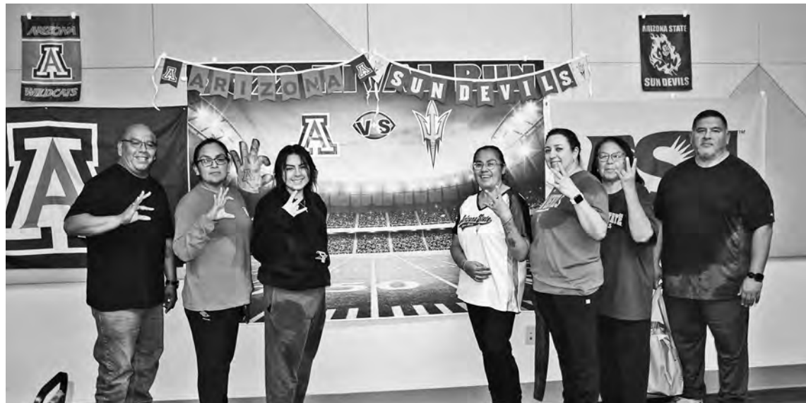
Team University of Arizona vs. Team Arizona State University