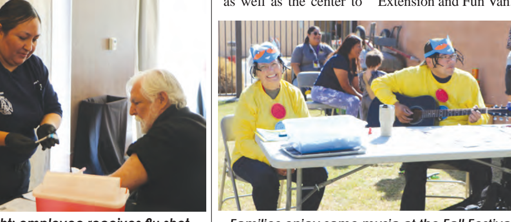
Families enjoy some music at the Fall Festival.