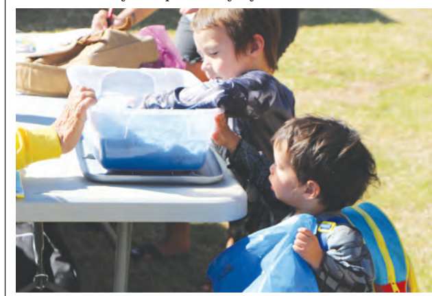
Students have fun creating art at Fall Festival.

November 1st, Ak-Chin Child Development Festival returned in a small way in an effort to build back up to the capacity it was previously, and provide resources for young students and families.