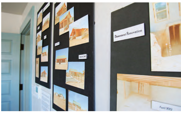
Renovation plans of Historic BIA Agent House.