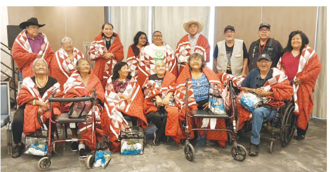
Above, Ak-Chin Elders gather after they are all gifted with 8th Generation wool blankets for their participation in the O'odham Ñeok Project at Ak-Chin Circle on August 17.