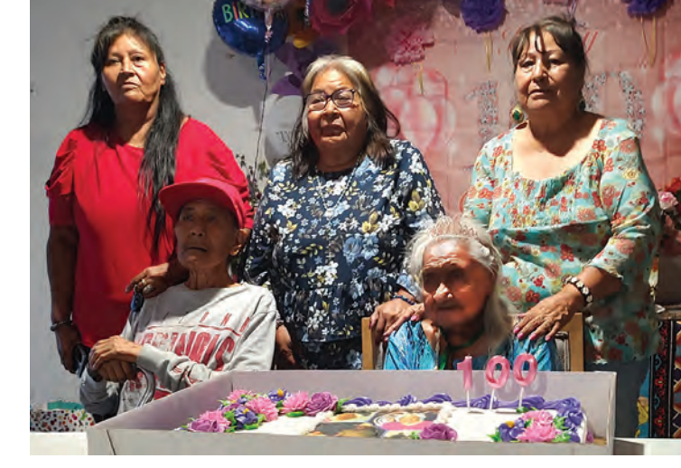
Ñeok continued from Front

We are surely blessed to have her still here with us. She stayed through the whole celebration and was still wide awake.