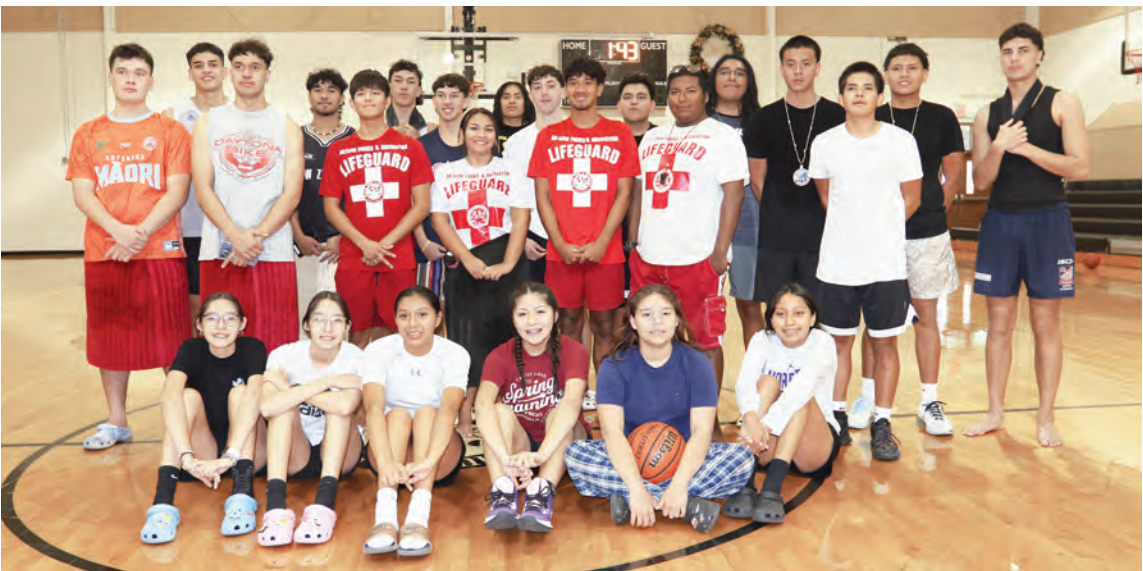
Above, members of Ak-Chin's boys and girls NABI teams, along with Ak-Chin lifeguards, gather with boys from the Aotearoa-Maori, New Zealand basketball team during a morning basketball drill, pool party and Cultural Exchange before the NABI events. (Please see page 6 for more photos and story on Cultural Exchange.)

Story by Tyaun Marshburn and photos by Runner Staff