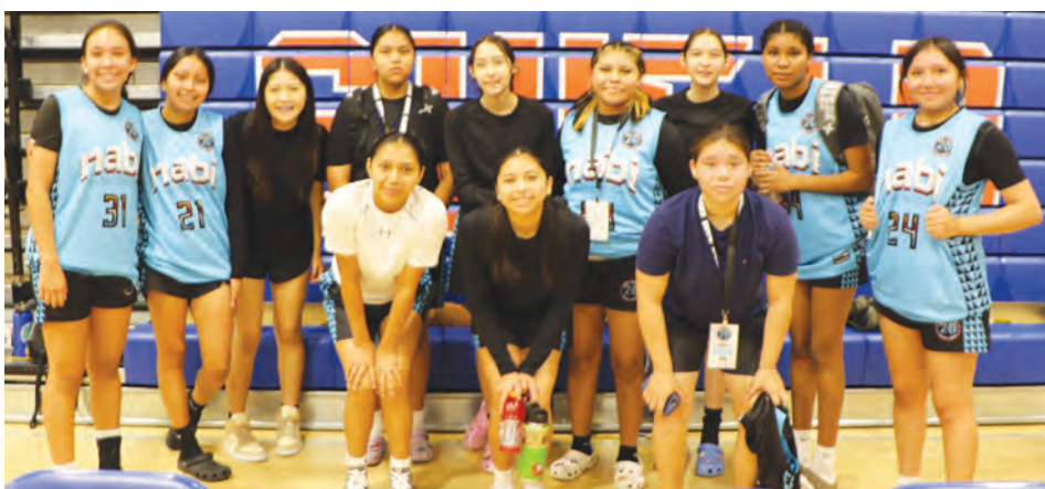
Ak-Chin girls basketball team

cheering her kids on, she volunteered to work the event.