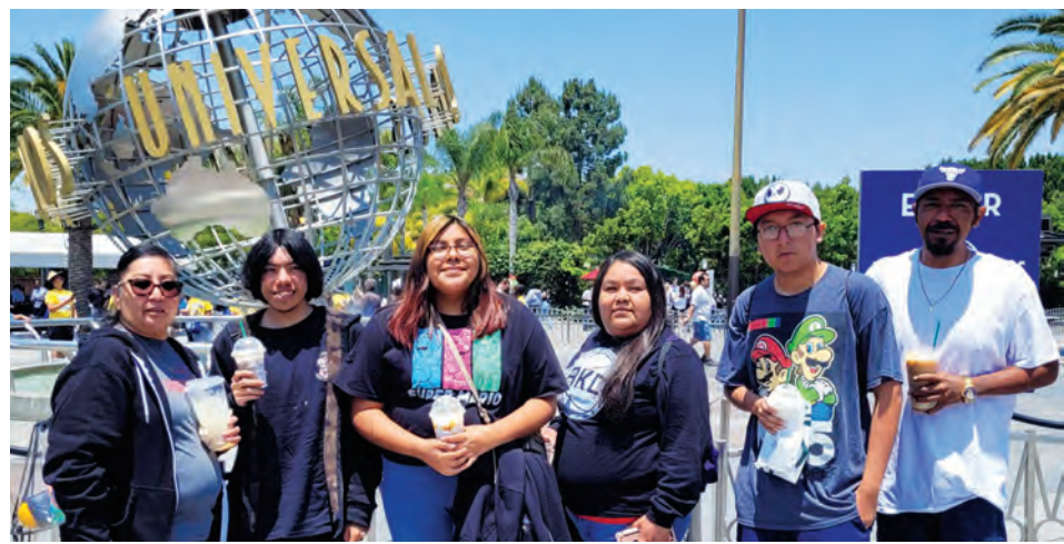
California Graduates and Chaperones at Universal Studios.