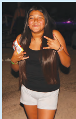
Girls pose pool side at the dive in movie event