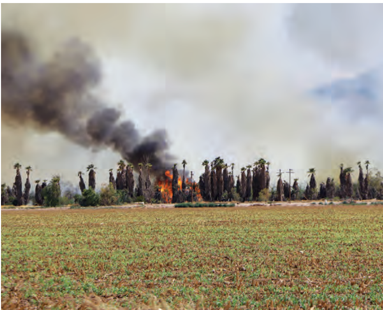
Tree Farm Fire as seen from Pima Rd.

On their final day, they traveled back to Ak-Chin Indian Community returning on June, 26.