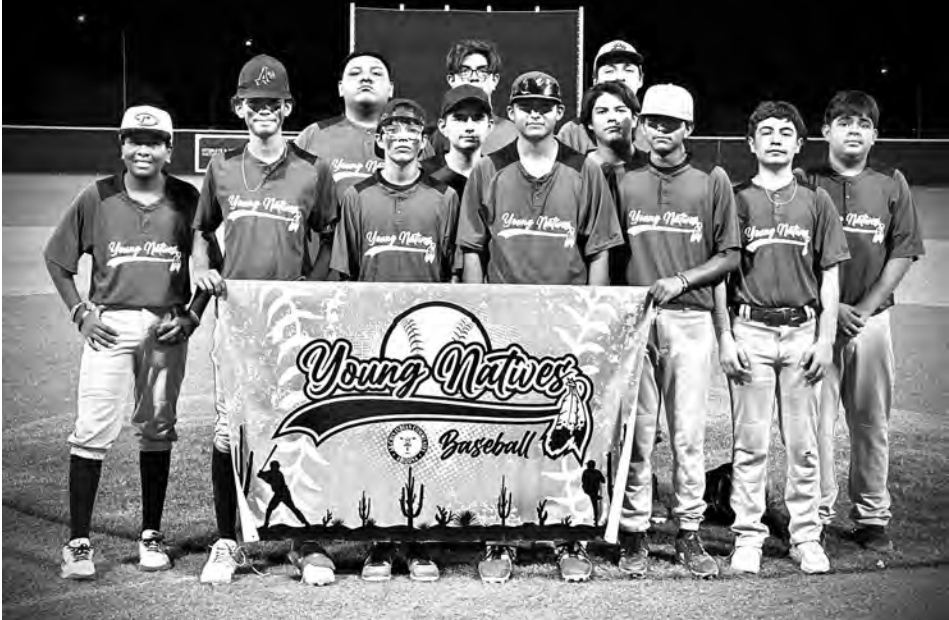
Young Natives fought hard to earn second place.

Unfortunately, the Warriors were taken out in the first round. This is the second year Warriors have participated in the Piestewa Games.