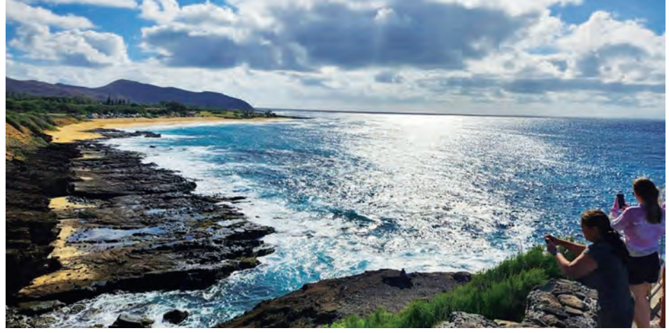
Lookout Point from Oahu Circle Island Tour