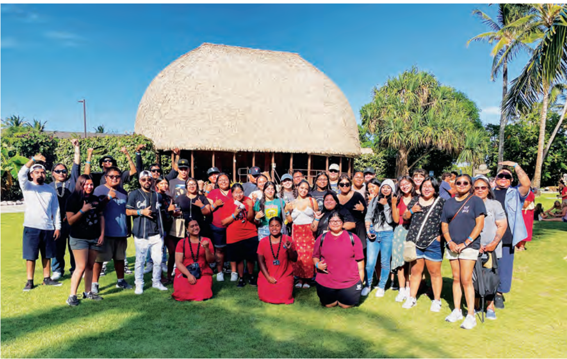
Ak-Chin Graduates at Polynesian Cultural Center, Hawaii.