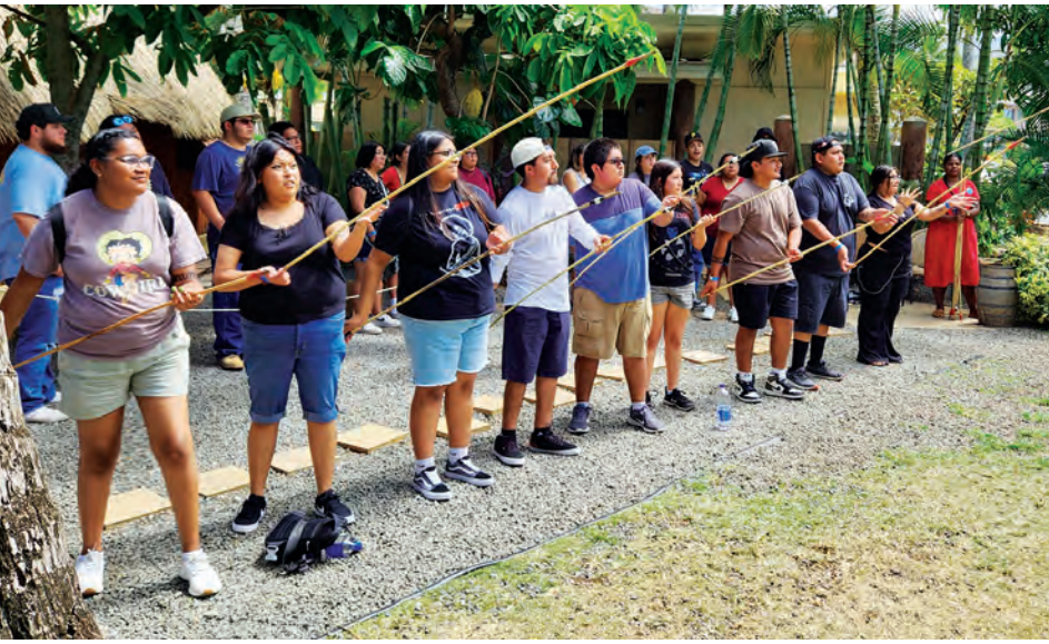
Graduates participating in activity at The Polynesian Cultural Center.