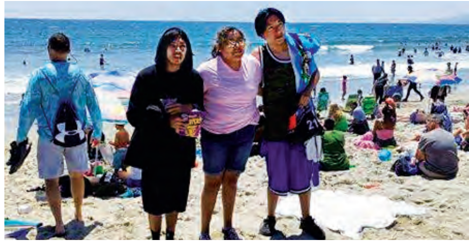
California Graduates at Santa Monica Pier