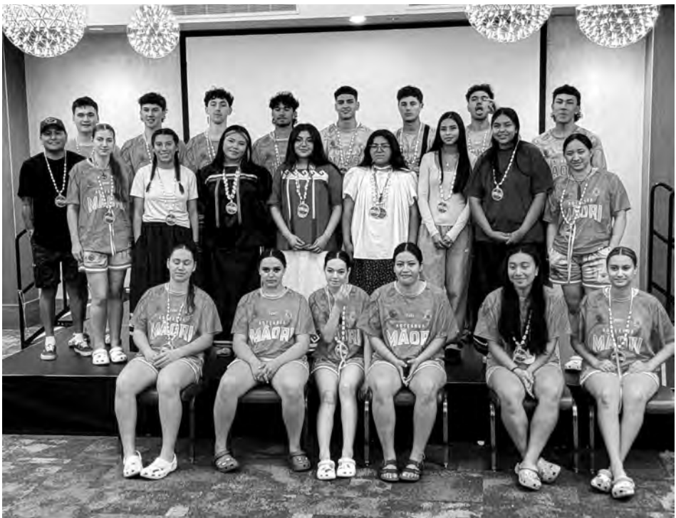
Above, Ak-Chin Youth Council and Team Aotearoa-Maori at the Cultural Exchange event, Sunday, July 16 at Ak-Chin Circle Elements Center.