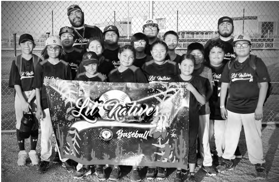
Lil Natives played hard and had a great season.

During the weekend of July 14, two little league teams, a co-ed softball team and volleyball teams; all comprised of Ak-Chin members, traveled to Legacy Sports Park in Mesa, AZ. to participate in the 2023 Lori Piestewa National Native American Games.