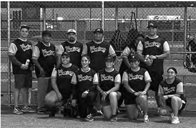
Ak-Chin Warriors Co-ed Softball team always ready to play!

This year marked the 20th anniversary of hosting these sporting events in her honor.