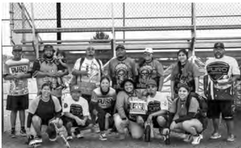
THIRD PLACE - PURO