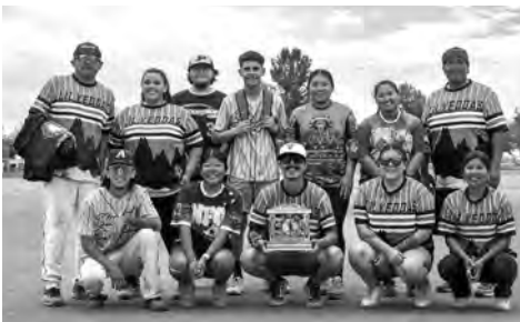
SECOND PLACE - LITTLE YEDDES