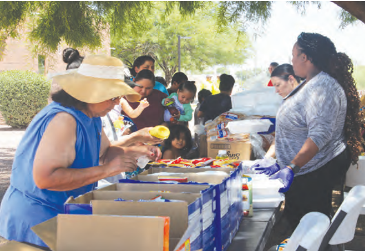
The temperature was in the 90s on June 1, fortunately community members were able to cool down in Ak-Chin's Community pool during the 14th annual Luau hosted by Ak-Chin Police department.