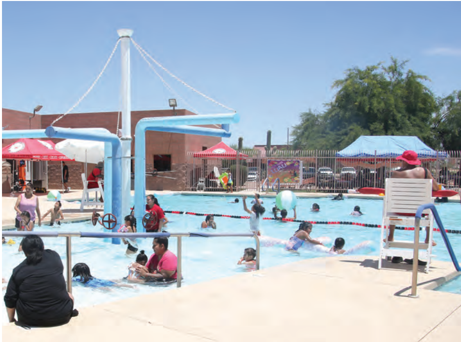
Above, everyone is enjoying a cool dip in the pool for the 14th Annual End of School Year celebration, June 1, at Ak-Chin Recreation.

The Ak-Chin Police department hosted their 14th Annual Luau at Ak-Chin Recreation's pool on Thursday, June 1, 2023.