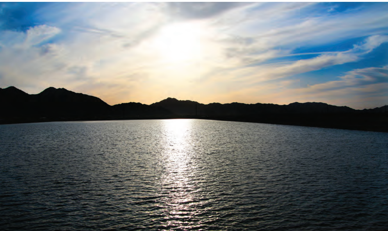
Ak-Chin Reservoir sits at the southwest border of the Ak-Chin Indian Community.