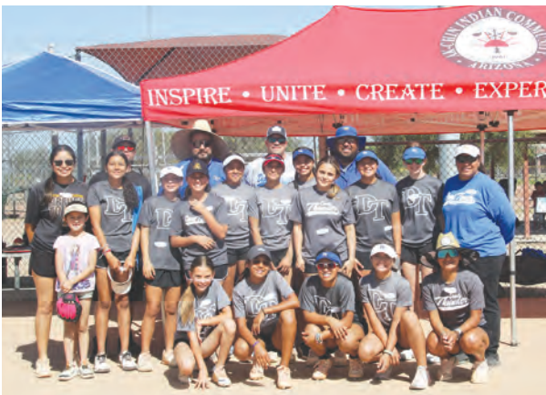
Desert Thunder Softball team pose for group photo before the softball skills sessions.

On April 16, Ak-Chin Parks and Recreation hosted a softball youth skills camp for boys and girls, ages 6-17. The event was held from 3pm-8pm at the Milton "Paul" Antone Memorial Park.