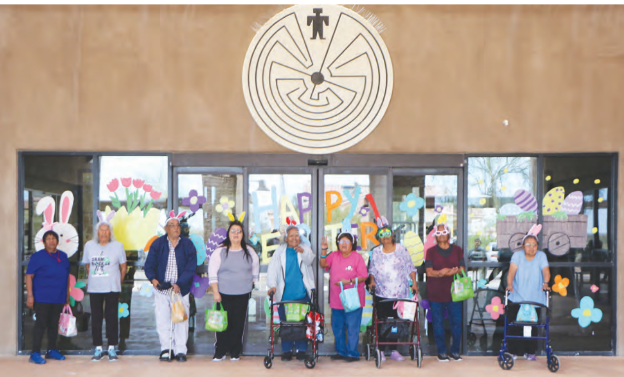
On April 6, Ak-Chin Elders participated in their annual Easter egg hunt. The Elders also enjoyed coloring eggs and then hunting for the hidden treasures! It was a fun day for all. We hope everyone had a Blessed Easter. Submitted by Ak-Chin Elder Center.