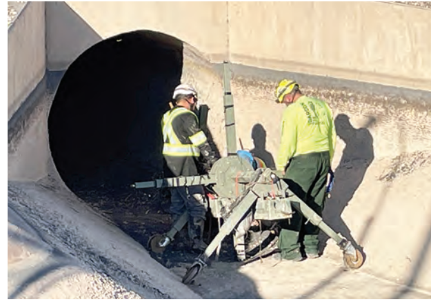
Testing performed by Pipeline Inspection and Condition Analysis Corporation to Ak-Chin Link Pipeline, December 2022. (Photos submitted)

transports water from Lake Havasu to Tucson.