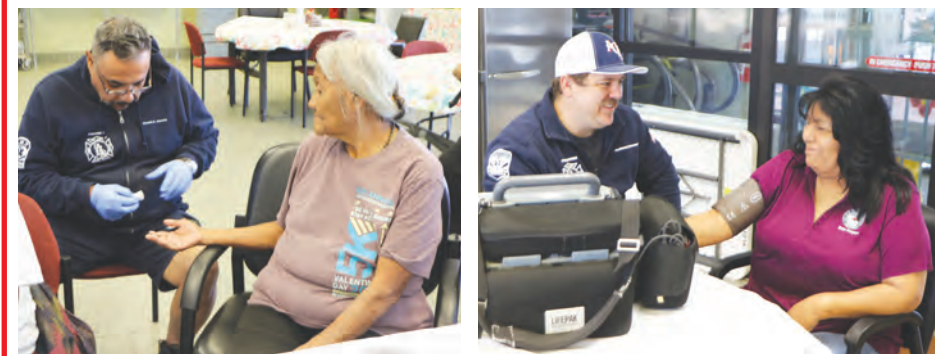
The Ak-Chin Elder Center provided blood pressure and glucose checks on April 5th. This is open to Community members and residents who would like to have their levels checked. The next blood pressure and glucose check will be on May 3rd at 9 am. The location is at the Elder Center. Community members and residents are welcome.