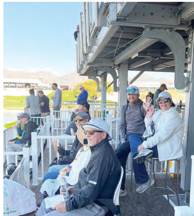
Ak-Chin Southern Dunes staff and patrons relax in 17th's Cove during Wednesday's ProAm.