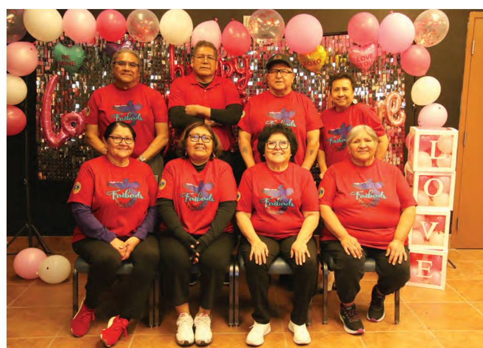
3rd Place - Ft. McDowell Firebirds