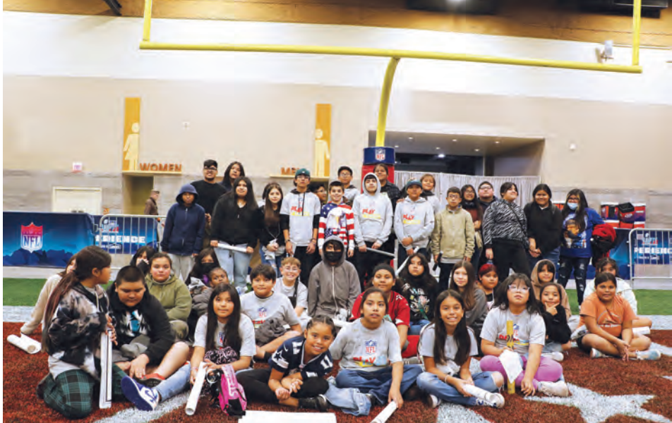
Ak-Chin students gather for photo during the NFL PLAY:60 YOUTH DAY at the Phoenix Convention Center on February 8. Look on page 5 for more photos and story.