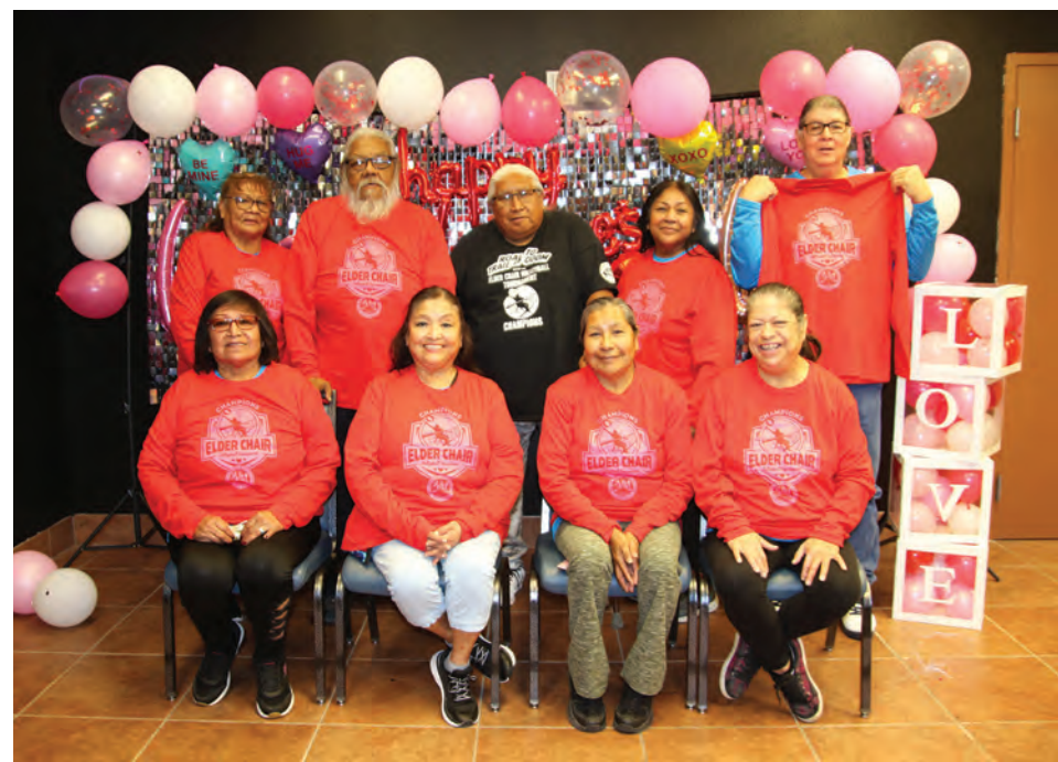
1st Place – Jackrabbits 1