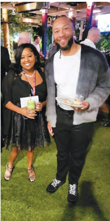
Enjoying a moment with Larry Fitzgerald at Palma.