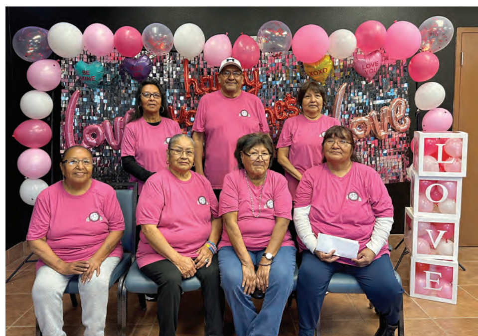
Team Tohono O'odham, representing Ak-Chin and Tohono O'odham enjoyed playing in the Valentine Elder Chair Volleyball Tournament.