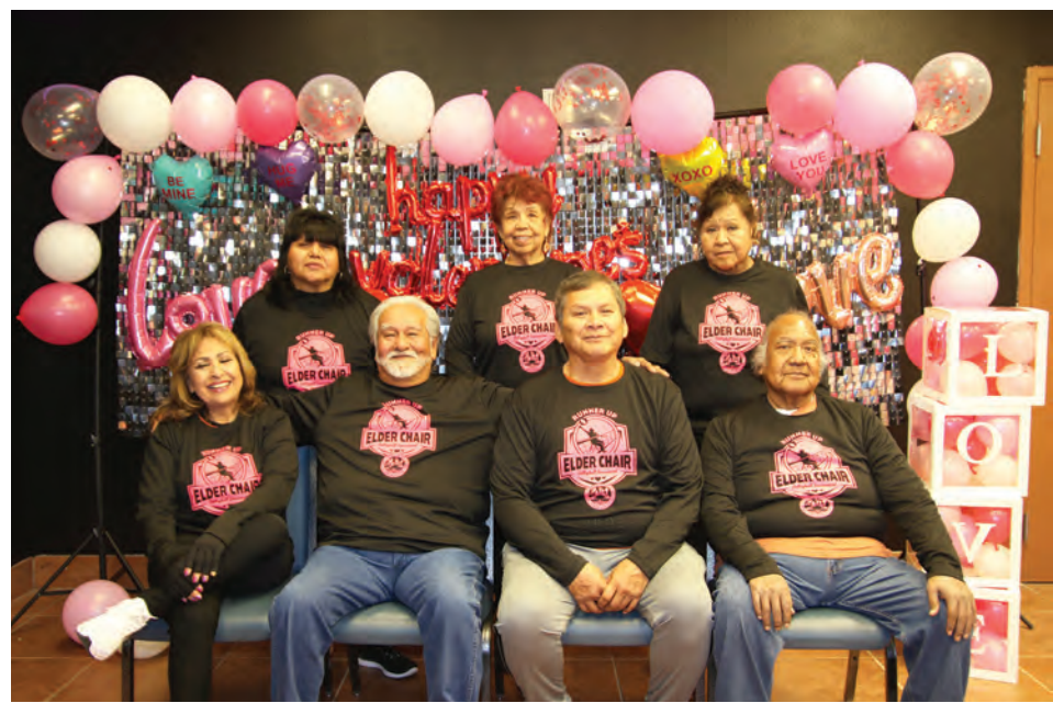
2nd Place - Salt River Steppers