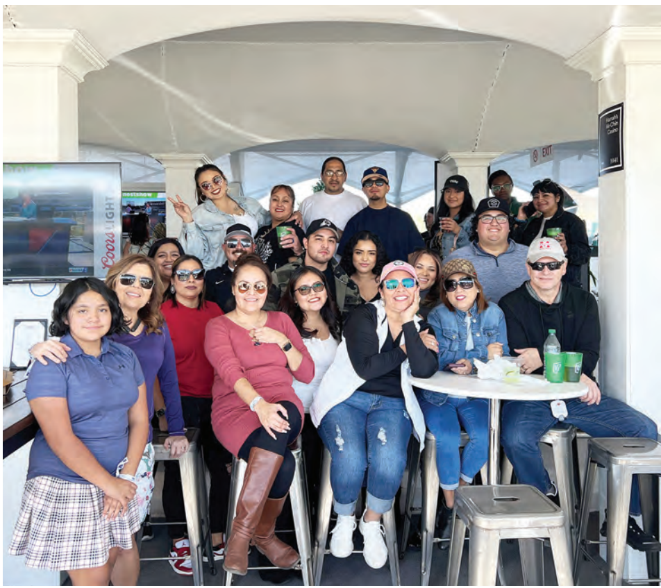
Ak-Chin Community members and employees enjoy Tuesday outing on the iconic 16th hole at the Phoenix Open, February 7.

Arizona played host to two major events last week as the 2023 Waste Management Phoenix Open Presented by Taylor Morrison was held in Scottsdale February 6 – 12, 2023, while Super Bowl LVII played in Glendale on February 12.