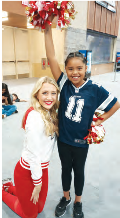
Ak-Chin youth enjoy football memorabilia and cheer opportunity at Phoenix Convention Center, February 8, 2023.

On Wednesday, February 8, there was an exclusive event held for elementary students at the Phoenix Convention Center, NFL PLAY:60 YOUTH DAY, where over 40 community kids, both members and residents, were able to go through football courses, try on