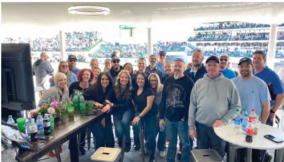
Top photos: Harrah's Ak-Chin Management Team gather for photos on Wednesday, February 8 at the 16th hole at WMPO.