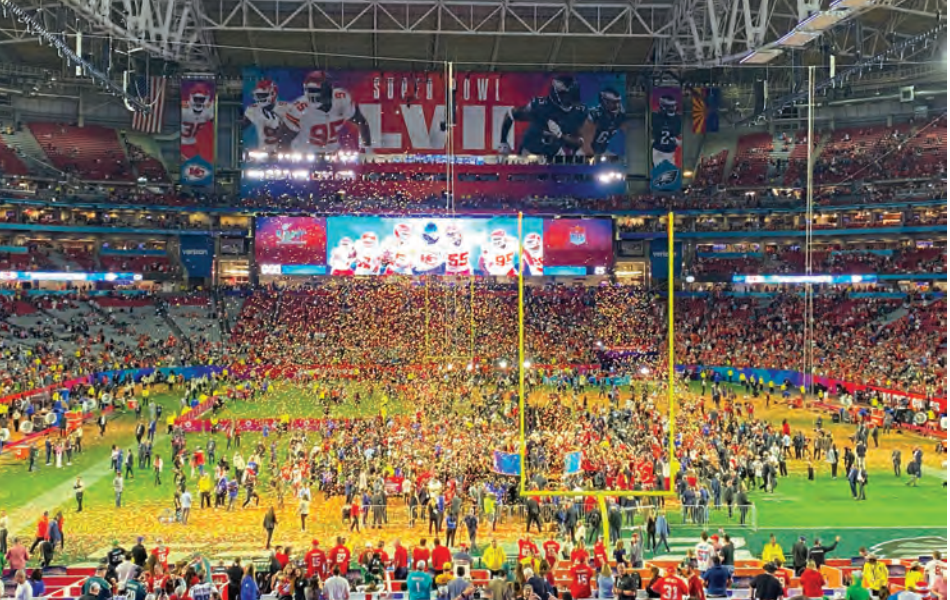
Kansas City Chiefs and fans join in celebration after their 38-35 win over the Philadelphia Eagles, at State Farm Stadium in Glendale, February 12.

Arizona played host to Super Bowl LVII, which was played at State Farm Stadium, Glendale, Arizona on February 12, 2023. The event brought many pro athletes and notable celebrities to the valley.