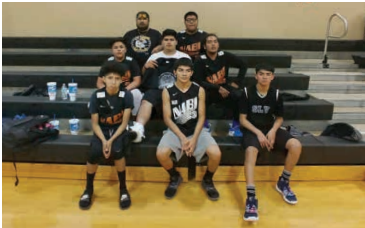
2nd Place: San Lucy