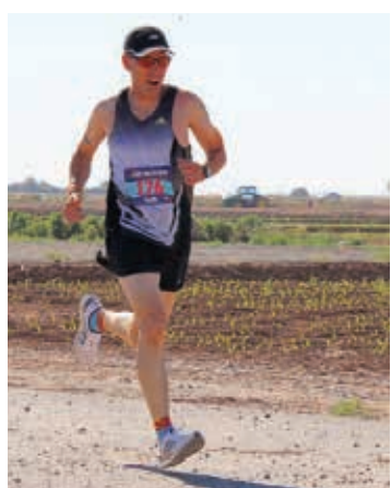
TOP LEFT: Runners leave the starting line. TOP RIGHT: The first runner in heads to finish line.