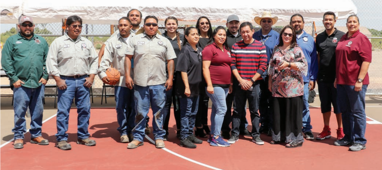
Ak-Chin Parks and Recreation Staff pictured with Ak-Chin Tribal Council on the new and improved basketball courts, located north of the recreation gymnasium.

April 4, 2019 Ak-Chin Recreation had an opening of the newly installed basketball courts North of the gymnasium.