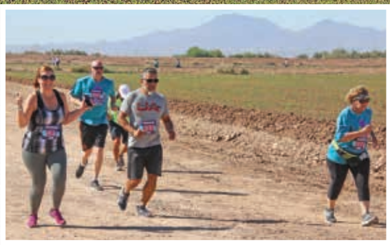
Runners as they head toward the finish line. The run route was south of Harrah's around the Ak-Chin fields.