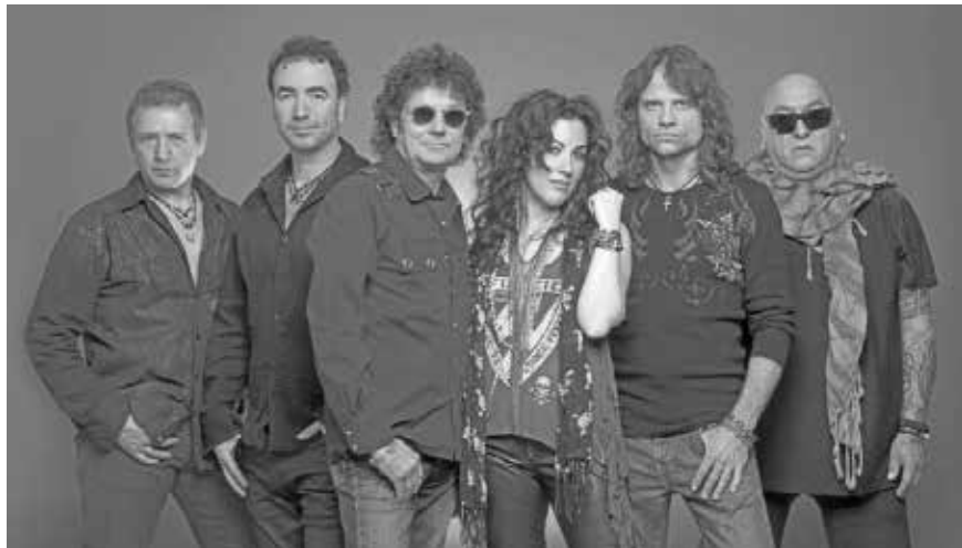
Starship featuring Mickey Thomas (left) and Eddie Money (right) will perform for one show Sunday, May 26 at The Events Center at Harrah's Ak-Chin Casino.