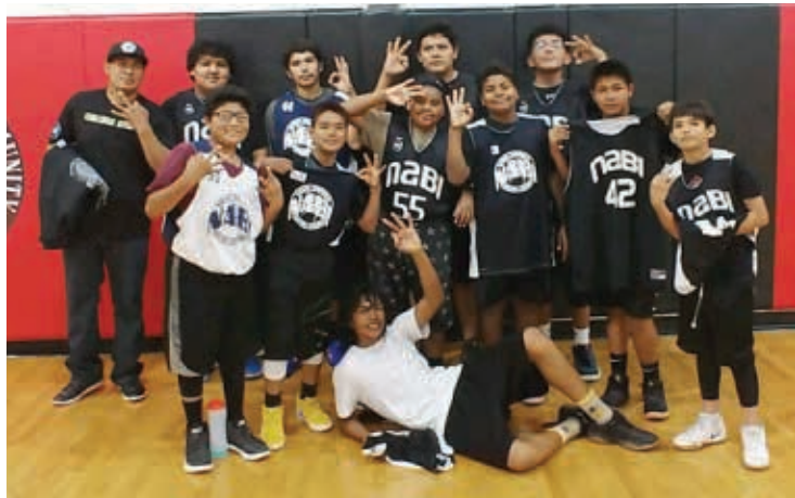
3rd Place: Casa Blanca

April 7, was a busy Sunday morning for student athletes, as eight teams dashed to Ak-Chin Recreation gymnasium for the 12-15 Boys Basketball League Tournament. Teams Casa Blanca, Rez Boys, San Lucy, Team Wumbo, Gila River, Copa Force and Ak-Chin; with two teams in the tournament; played from 8 am to 1 pm, enroute to the league championship.