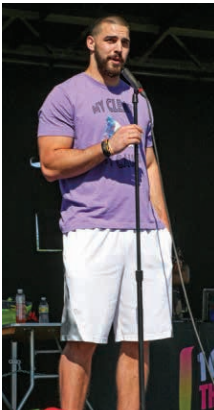
Arizonan/Baltimore Ravens Tight End Mark Andrews speaks at the 2019 JDRF One Walk. Andrews was diagnosed with T1D at the age of 9.

The Ak-Chin community has been a sponsor for this JDRF foundation for many years now, and has always had a strong showing of support at this event with many walkers, as well as runners.