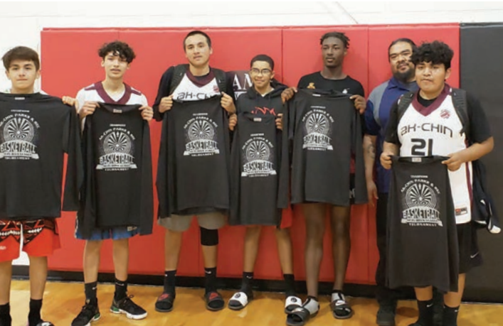
1st Place: Ak-Chin