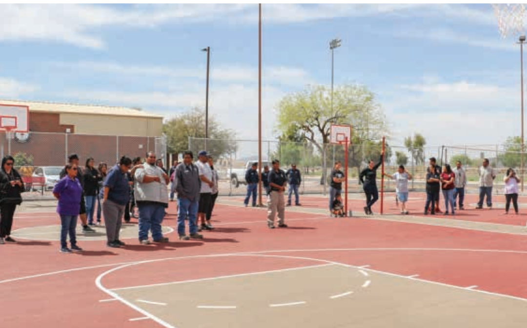
L to R: The community gathers to witness the ceremony and listen to all presenters during at the re-opening of the northern basketball courts.