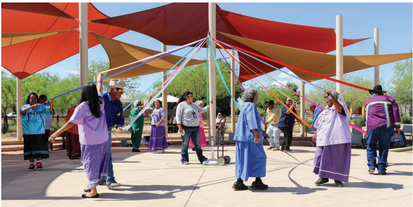
A Kualia group from Tohono O'odham Nation performs a ribbon dance during the Him-Dak Celebration.