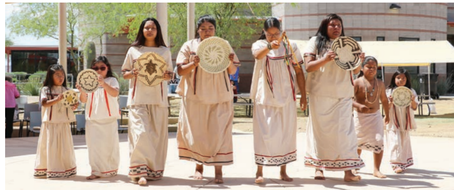
Ak-Chin Ba'ban Kehina dancers perform during the celebration.

"It means a lot to me too, I love being here" replied the Congressman.