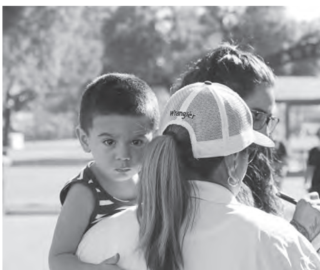
This little guy is patiently waiting for his new seat to be installed.