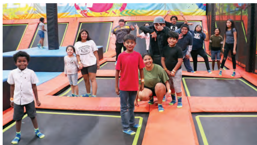
Above: Everyone was ready for a picture at Urban Air Adventure Park.

This year's Fall break was an all-around amazing time for Ak-Chin students and parents alike.