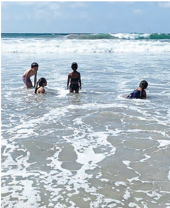
At right: Kids got to enjoy a day of swimming in the ocean or relaxing at the beach in San Diego before heading back home.