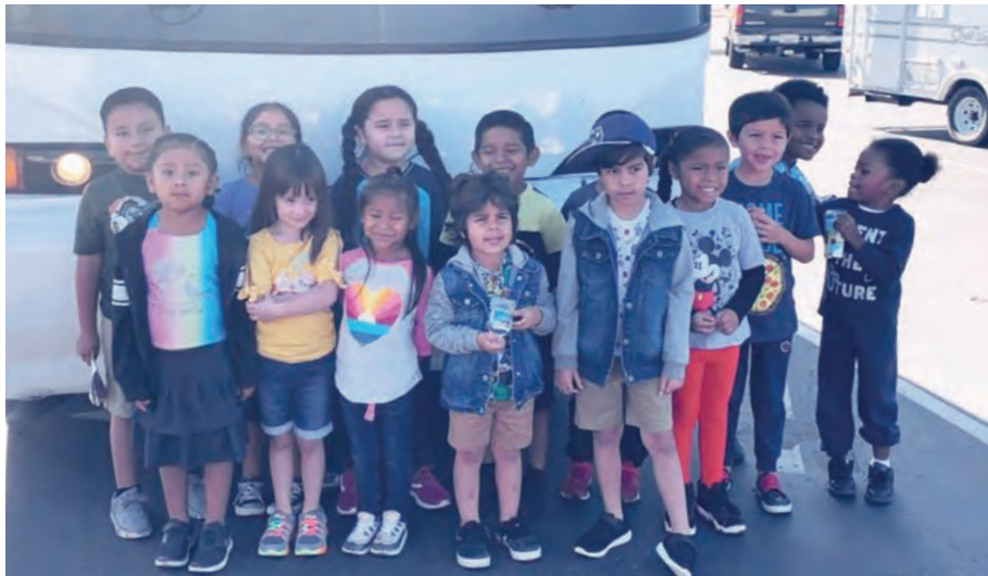
Waking up bright and early the group of children get ready for their lengthy trip to California via commercial bus provided by Council.