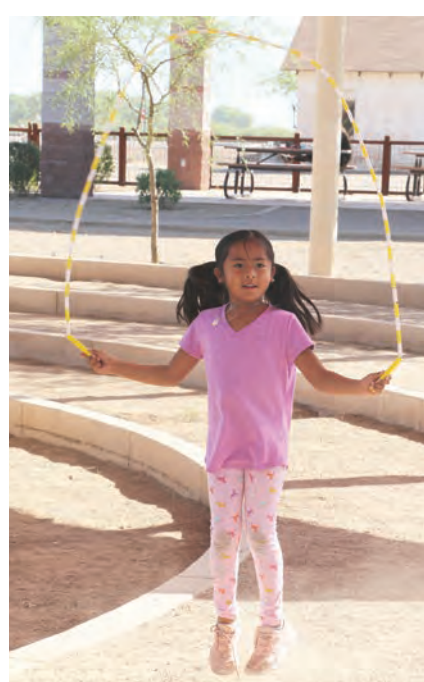
Play time and game time was an essential during the Fall break.