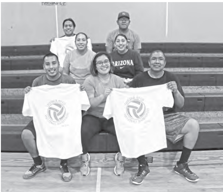
3rd place - That Squad

October 5th, seven teams played several rounds of high velocity volleyball in the Spooky Recreation Co-Ed Volleyball power play tournament