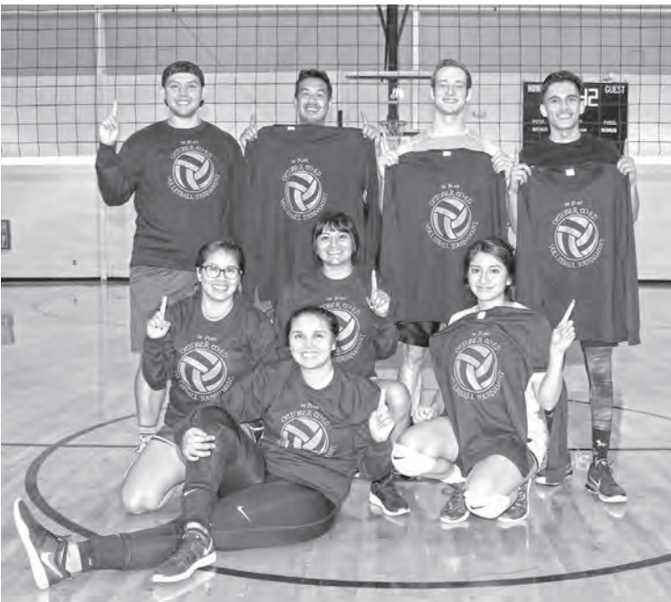
1st place - Young Gunz