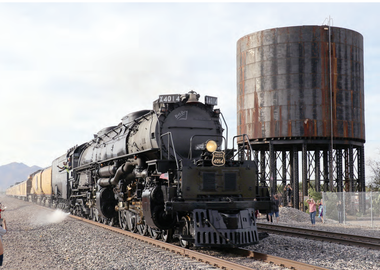
Union Pacific Big Boy No. 4014 passes through Maricopa on the way to Casa Grande for the night. The locomotive crew waves to onlookers who are enjoying the experience in front of the water tower.