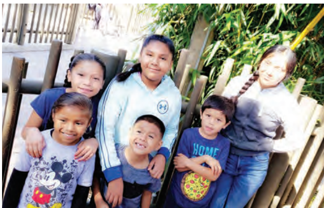
Above: This family has a blast at the brick city.