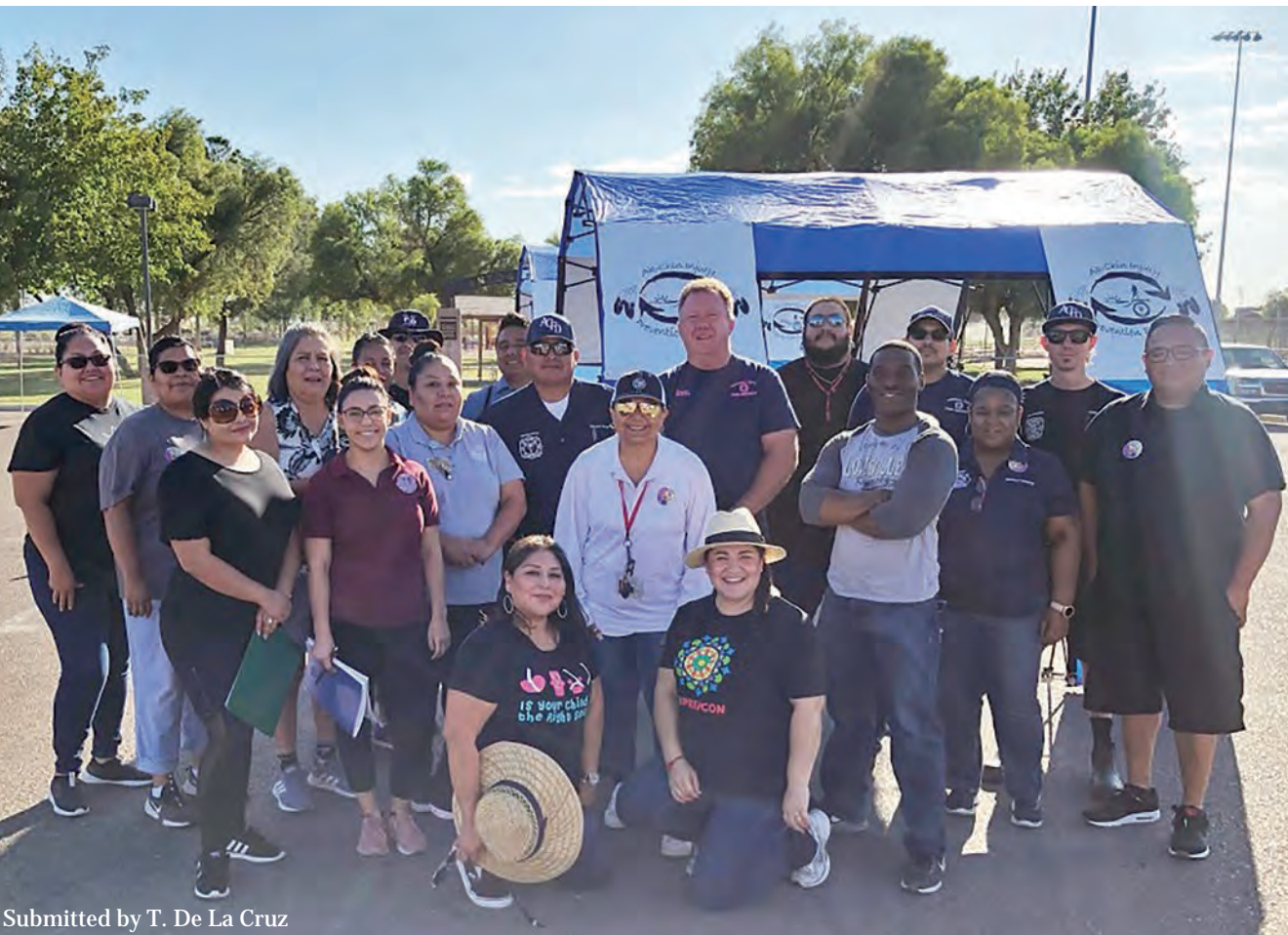
Pictured are the certified child passenger safety technicians who helped families give safer driving experiences during the Car Seat Check-Up Event.