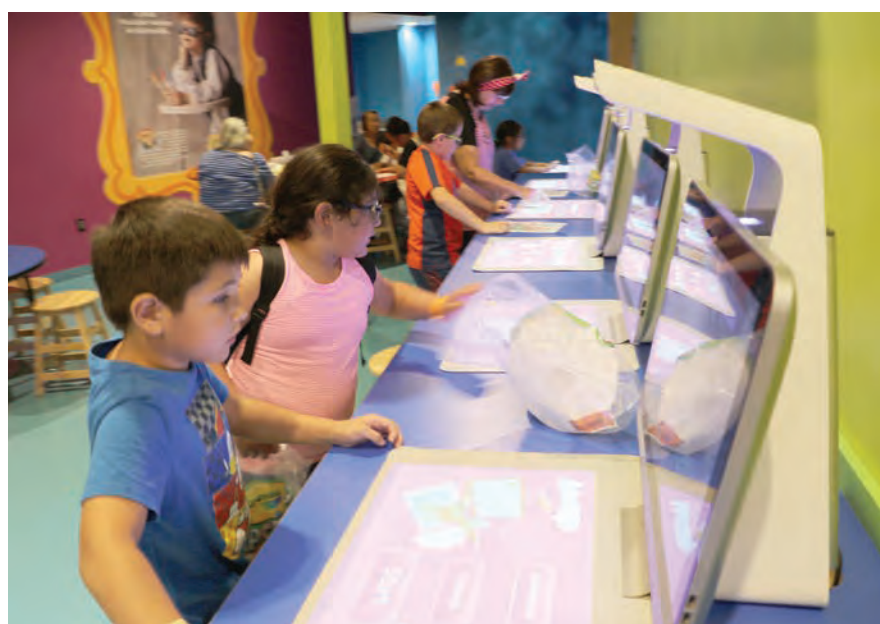
Creativity was flowing through these little ones at the Crayola Experience.