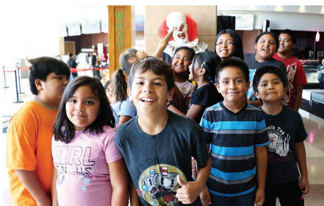
They'll float too!