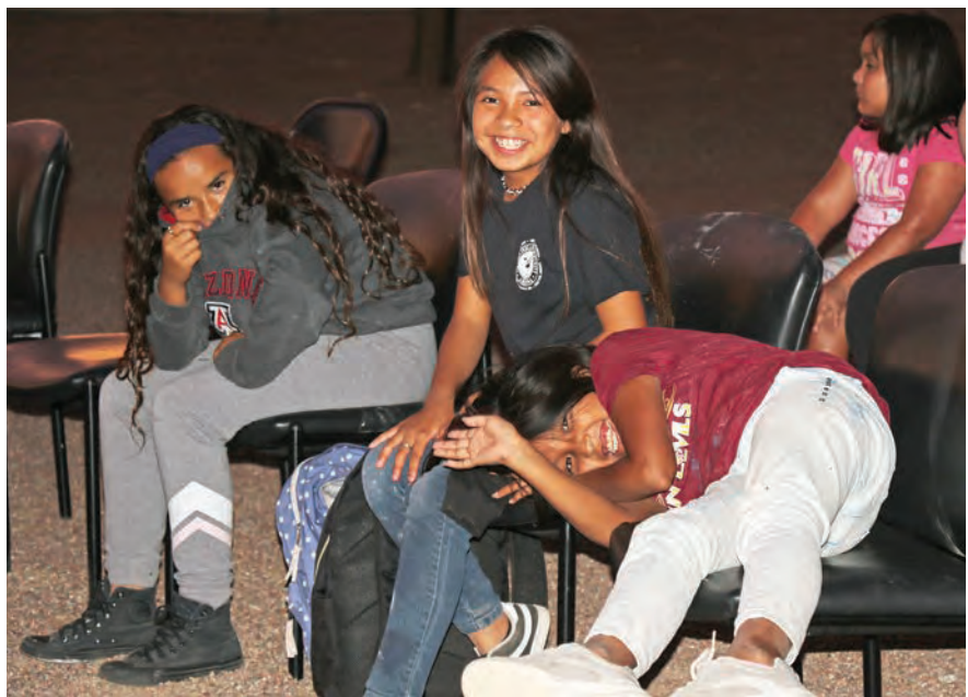
These girls aren't afraid of listening to a few spooky stories.