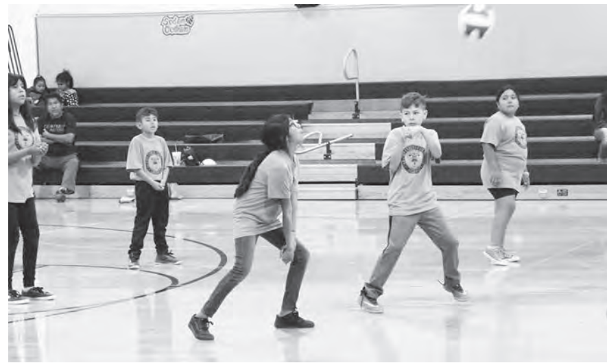
Ak-Chin Native Warriors in action during Week 3 vs. Sacaton D3. Native Warriors are one of three teams from Ak-Chin in the 9-12 year old age division.

Week four is up next for the Ak-Chin teams on Tuesday, October 22.