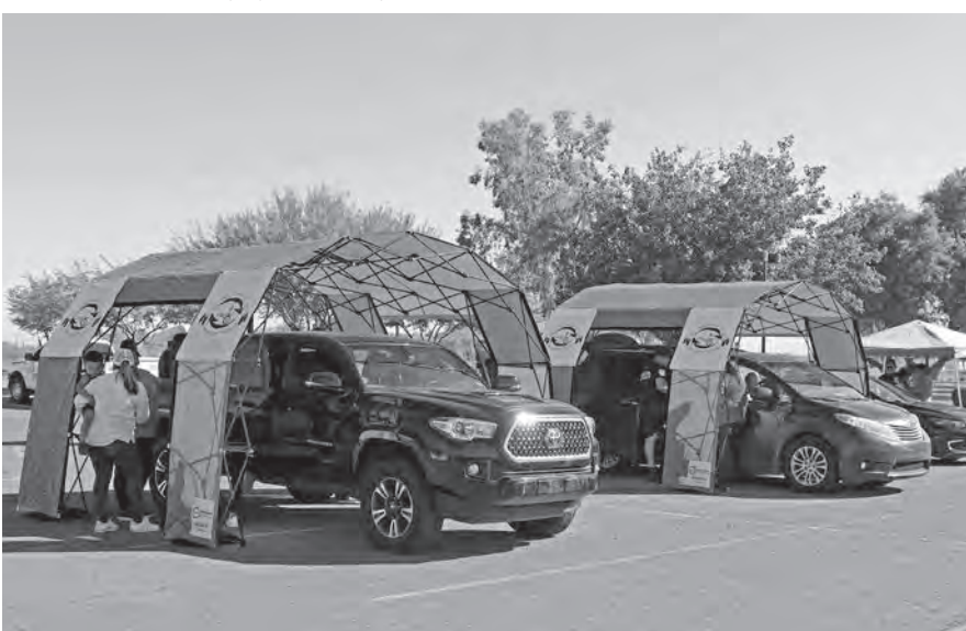
Car seat owners are being assisted with car seat details at the Car Seat Safety event held at MPA Park.

installed, proper education on said equipment and general knowledge anyone and everyone can prevent such irreversible damage in these drastic situations.