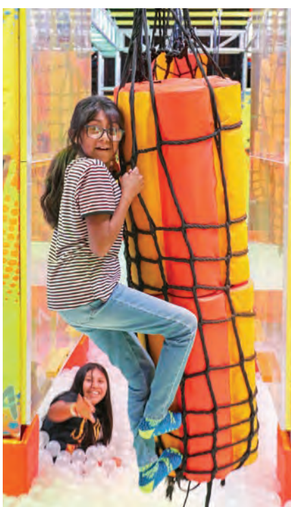
Right: Climbing up didn't seem like such a good idea.