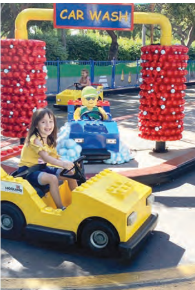
Vroom! Vroom! She's driving through the LEGO city streets.