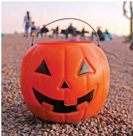
Top: A lonely jack-o'-lantern.