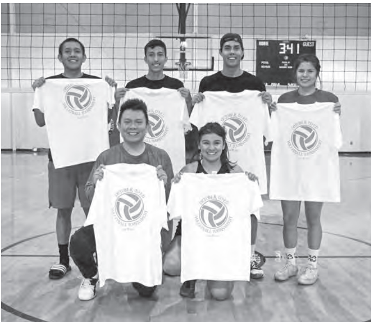
2nd place - Rocket Power