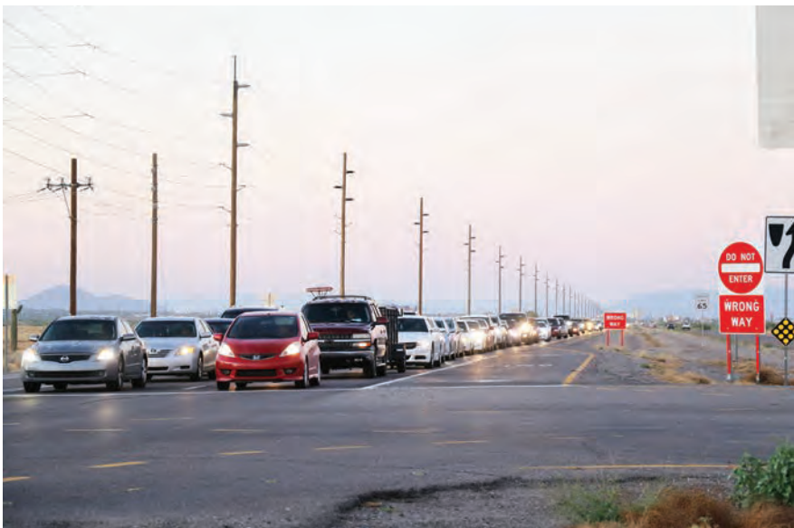
Traffic is backed up southbound on SR 347 at Riggs Road as the majority of drivers head back to Maricopa from the Phoenix area.

With the rising congestion along SR 347 from Peters and Nall Road to I-10, the Maricopa Association of Governments (MAG) is overseeing a scoping study to recommend a plan to provide a safe and reliable corridor that supports anticipated growth.