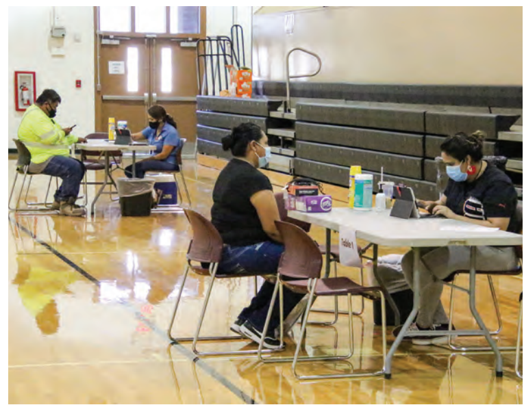
Parents give information to helpful staff during event.