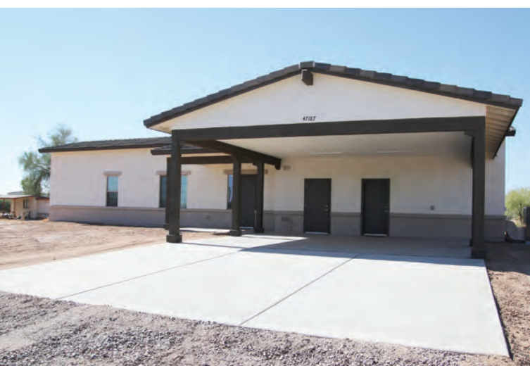
Outside the newly built home.

Once the homes were demolished and the pads were built by AR Mays, Pimmex began the vertical construction and the three homes were completed in just over six months.