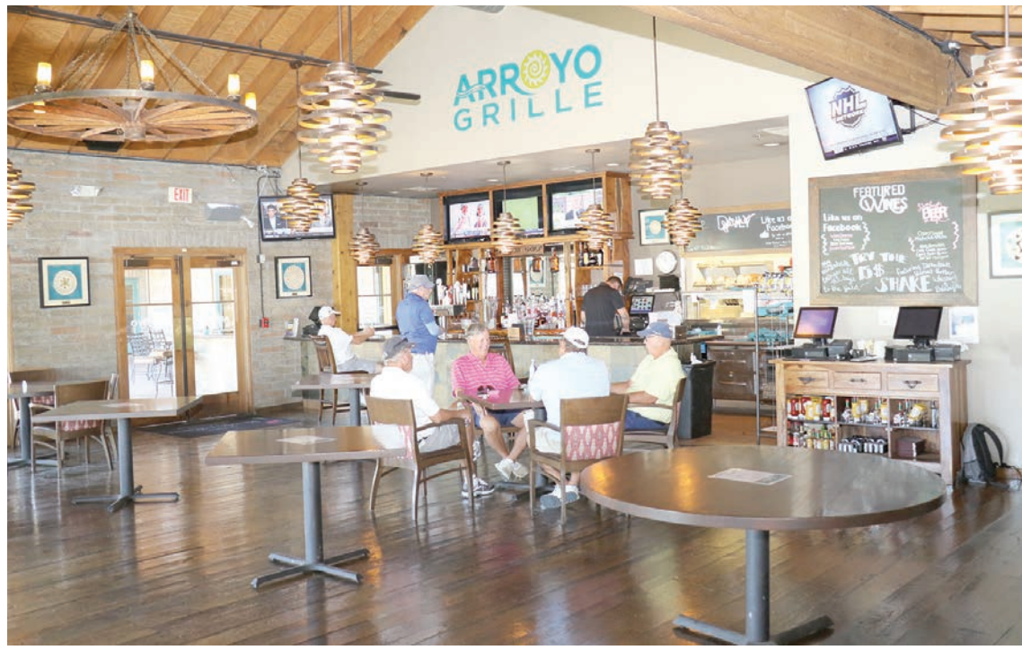
Guests at Ak-Chin Southern Dunes enjoy lunch inside the Arroyo Grille restaurant. Arroyo Grille opened its dining area on Monday, May 11, with limited seating and enhanced safety and sanitizing measures.

The experience is different now in the way that when guests come in and sit down, they are given a paper menu with the Arroyo Grille phone