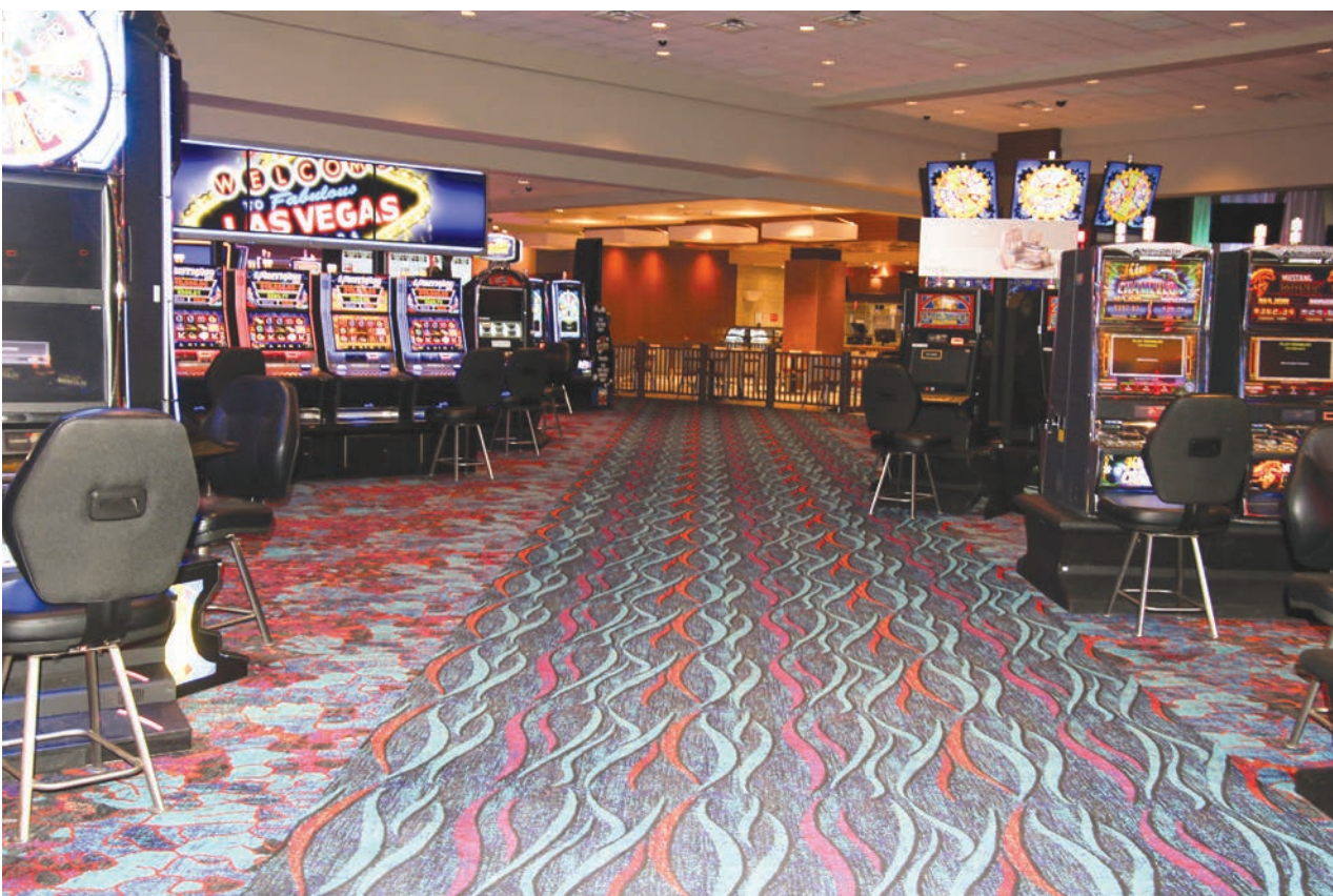
Harrah's Ak-Chin Casino may be empty in this photo, but on Friday May 15, they will open their doors at 9 am to welcome guests back with new social distancing protocols.